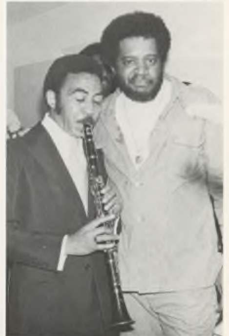
... with Donald Byrd.