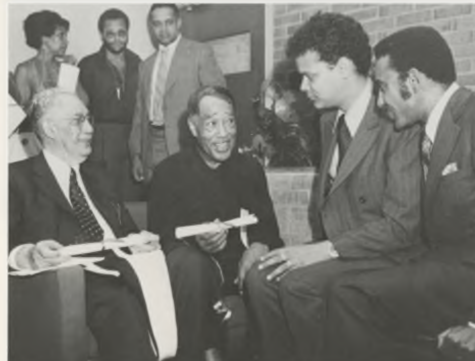
... with (left to right) Professor Sterling A. Brown, Duke Ellington and Julian Bond.