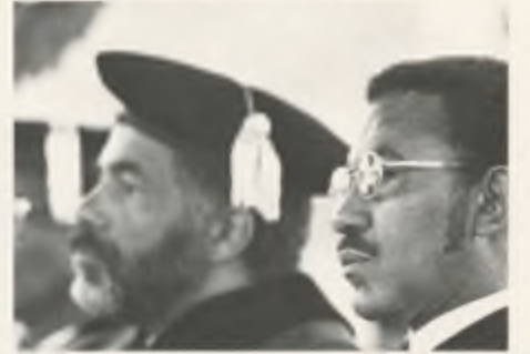
... with television personality Ed Bradley.