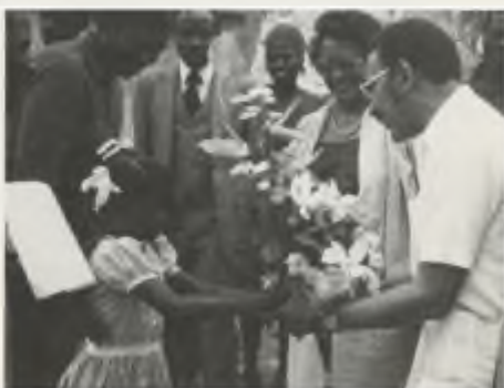
... on a visit to Haiti.