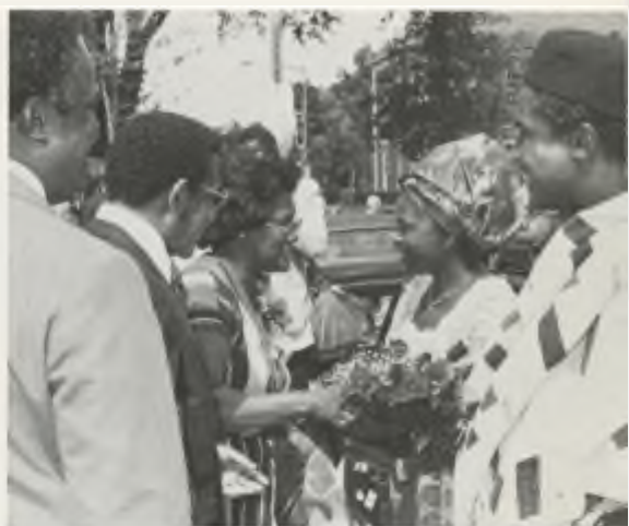
... with visiting African dignitaries.