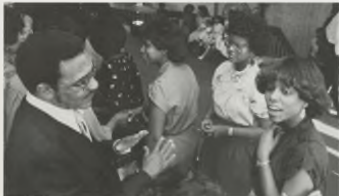
... with Howard students.