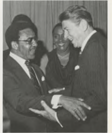
... with Ronald Reagan.