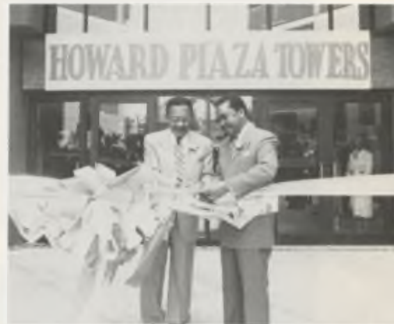
... at Howard Plaza dedication.