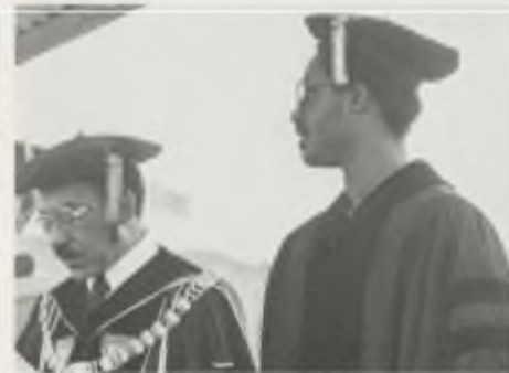
... with singer Stevie Wonder.