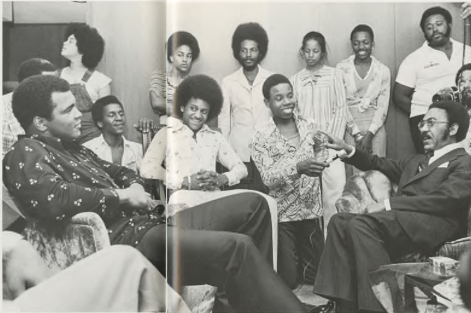
... with boxer Muhammad Ali.