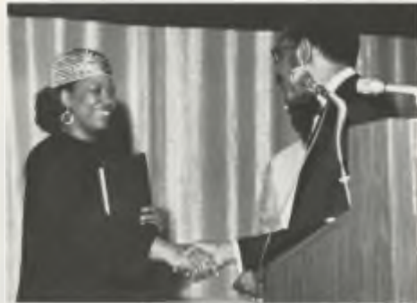
... with author Toni Morrison.