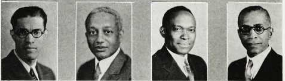
HEADS OF DEPARTMENTS OF INSTRUCTION