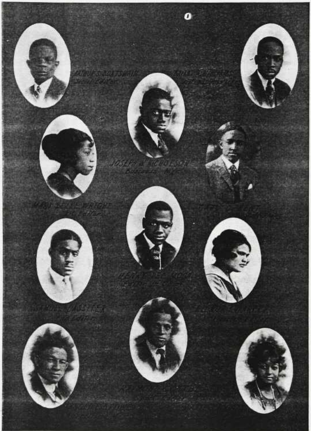
"THE BISON" STAFF