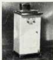
Ritter Model "C" Sterilizer

THE finest dental offices in the world are within the grasp of every dental graduate. Ritter equipment, recognized by the entire dental profession as the most modern equipment manufactured, may be purchased for a modest down payment—and the balance paid over a period of three years if desired.