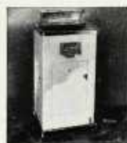
Ritter Model "B" Sterilizer