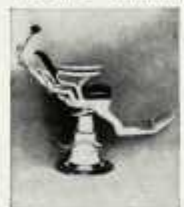
Ritter Foot-Pump Chair