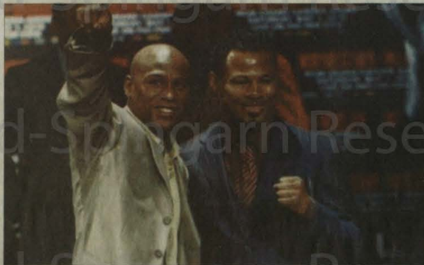
Famed boxers Floyd Mayweather and Sugar Shane Mosley held a press conference to promote their boxing match scheduled for May 1 in Las Vegas. Mosley has a record of 46-5, while Mayweather is undefeated.

Most of the audience favored Mayweather because of his charisma and trash talking.