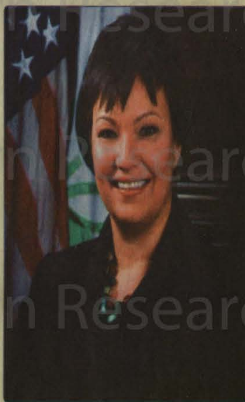
Administrator Lisa P. Jackson U.S. Environmental Protection Agency Keynote Speaker

"Leadership, Today, Tomorrow: Meeting The Needs of the Global Community"