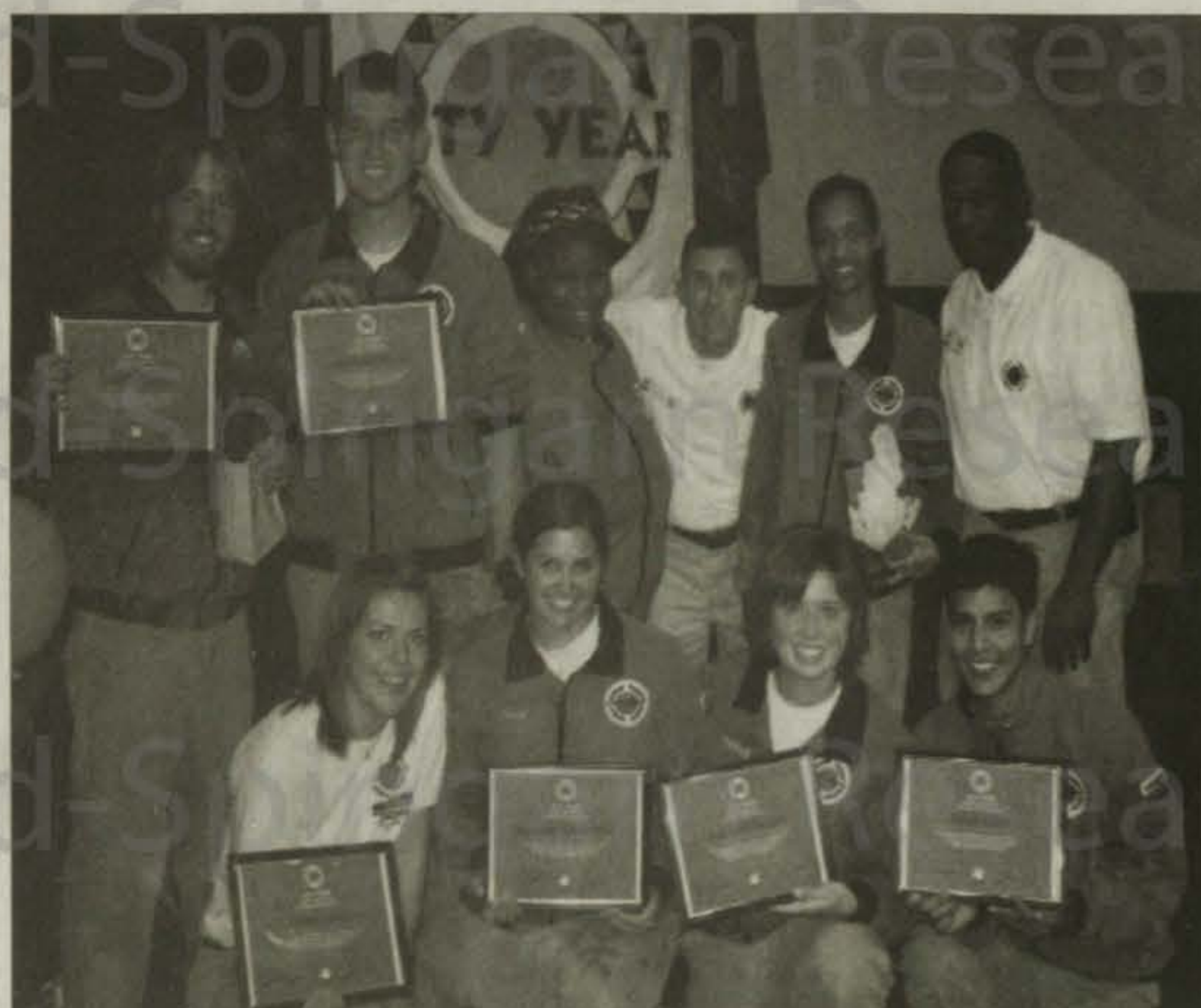
City Year volunteers engage in community service, chosen from 1,500 17 through 24-year-olds. The AmeriCorps organization was founded in 1988 at Harvard Law School, having served 1 million children since its founding.