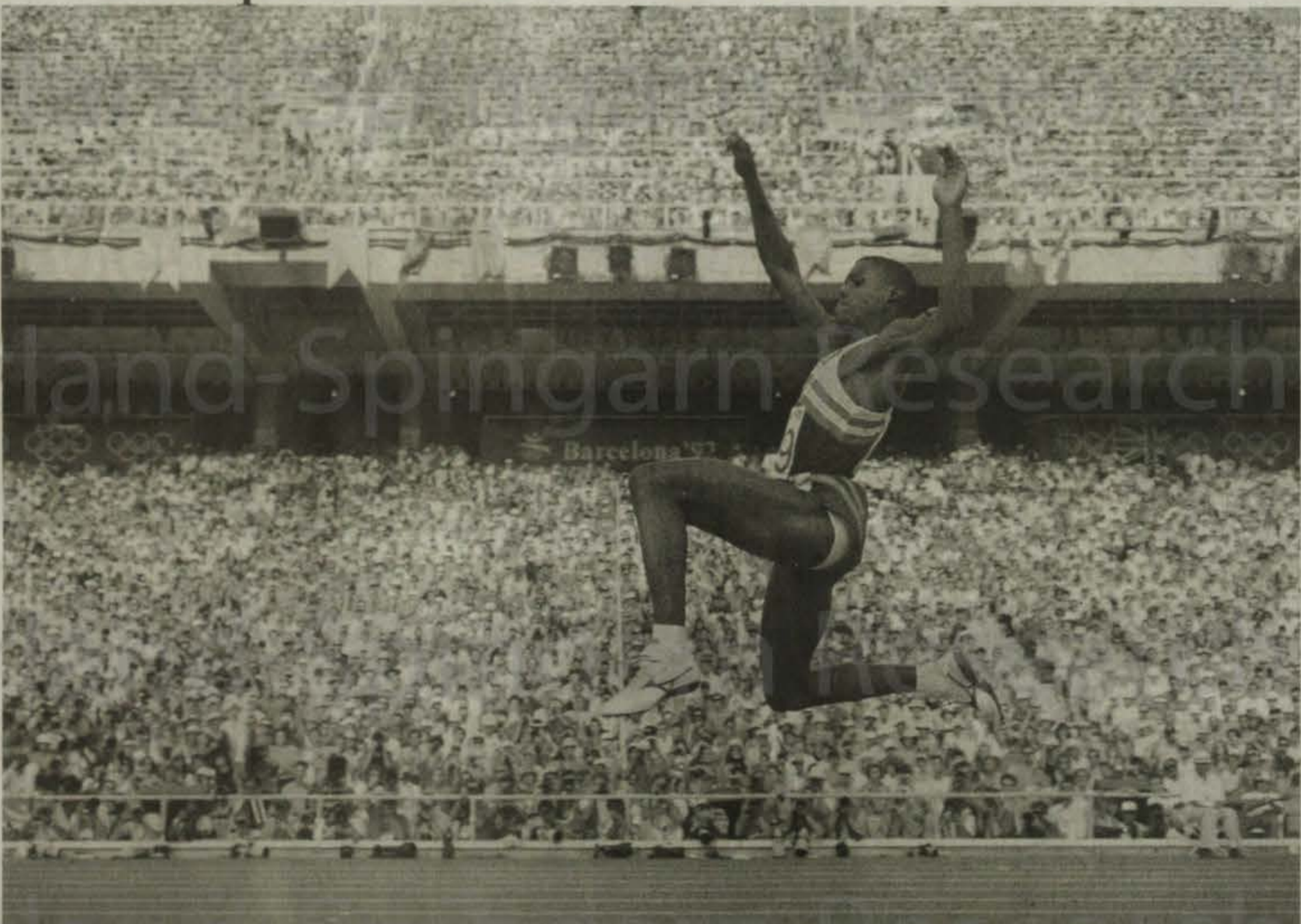
Carl Lewis was an American track and field star who won multiple medals in the Olympics, including a gold medal for the long jump in the above photo in the 1992 Barcelona Summer Olympics. Lewis won 10 medals in his career and set several world records in track and field events.

INTERESTED IN WRITING ABOUT YOUR HOMETOWN TEAM OR WANT TO COVER BISON SPORTS? EMAIL THEHILLTOPSPORTS@GMAIL.COM AND SHARE YOUR IDEAS.