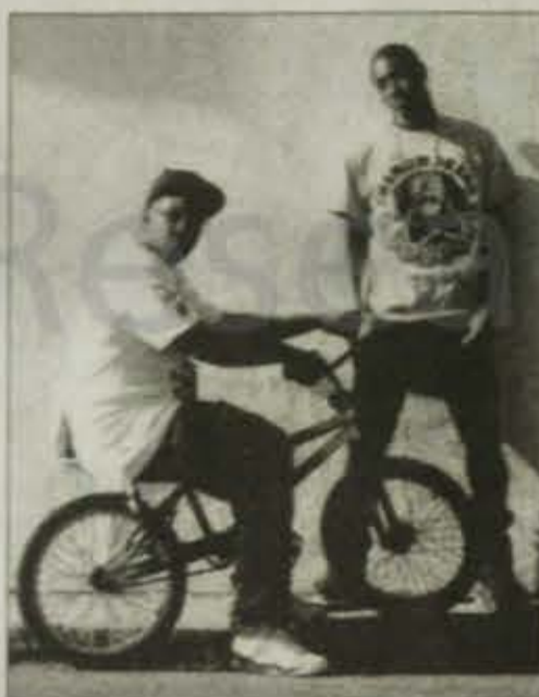
The Cool Kids, a duo rap group from Chicago, will perform at the show.