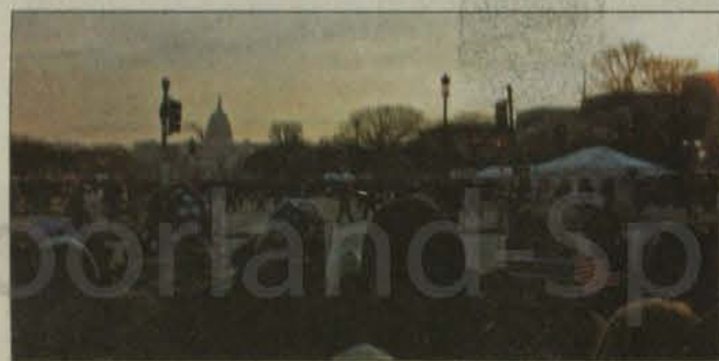
Sean Robinson - Photo Editor

The president backed his plan to freeze government spending in 2011 with a threat to veto its passage, but the freeze will not affect all government programs. Exceptions to the freeze on spending include national security and welfare programs.