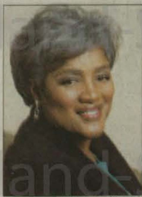
Political Strategist Donna Brazile will speak in the Blackburn Center.

Brazile is the founder of Brazile & Associates, LLC., a grassroots advocacy and training firm based in Washington, D.C.