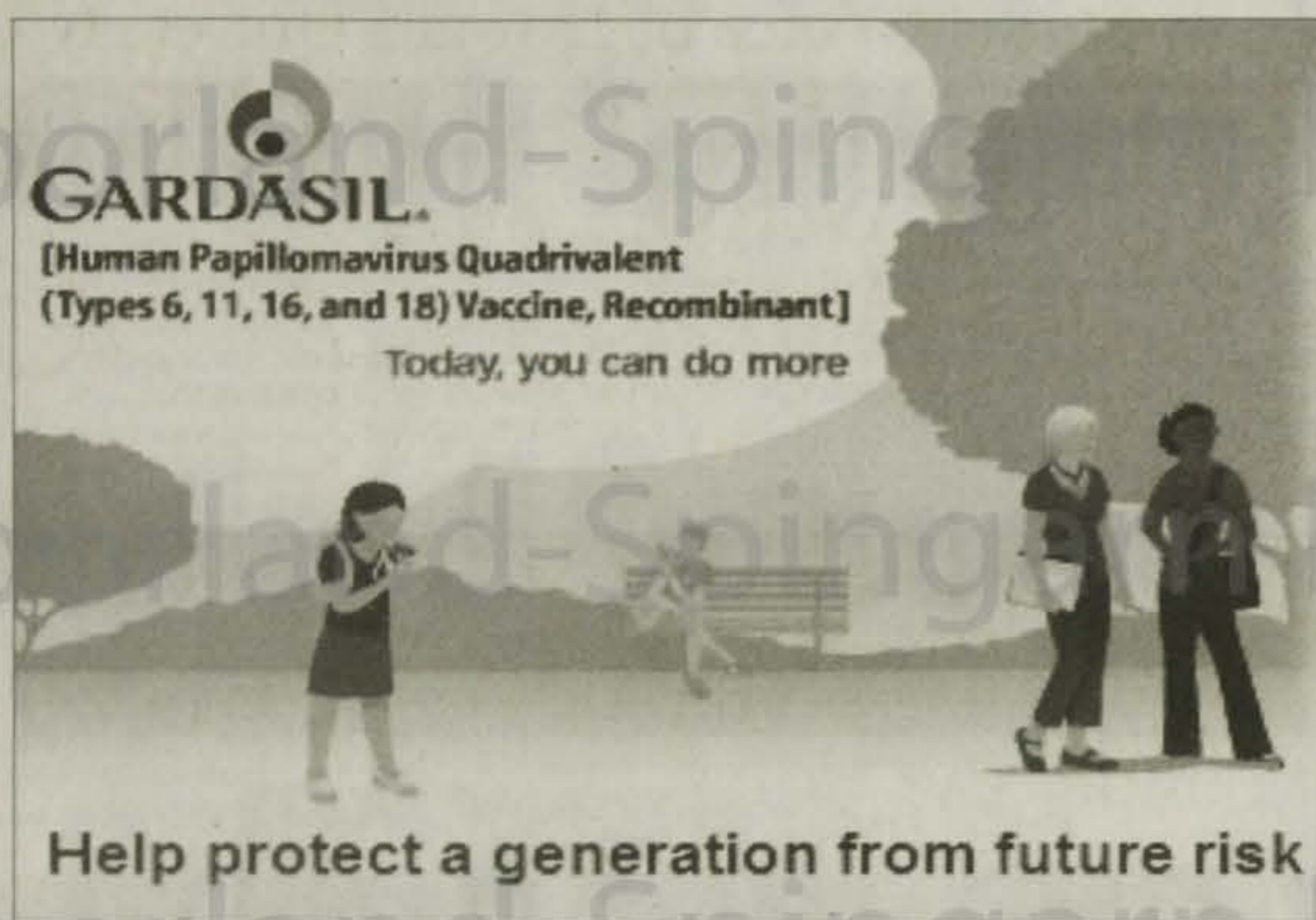
Merck Pharmaceuticals Company produces the HPV vaccine known as Gardasil. The vaccine comes with certain associated risks including miscarriages and fevers.

Gardasil, the No. 1 selling vaccine for the Human Papillomavirus, comes with certain risks that disturb many people