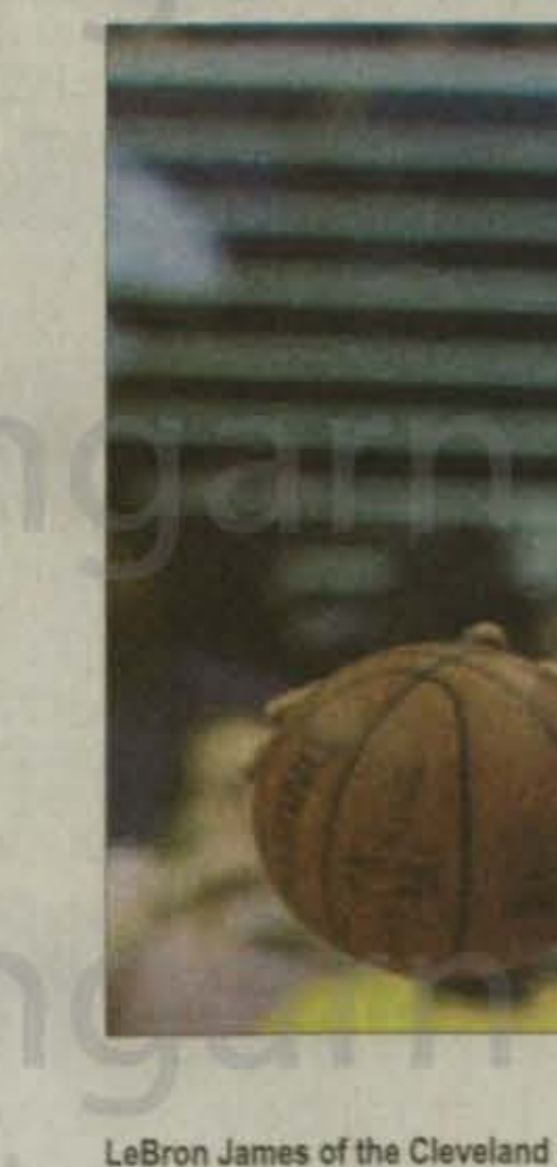
LeBron James of the Cleveland Cavaliers is thought to be MPV of his team for the second year in a row.

Some fans are even more confident about their respective teams. "The Cavaliers are going to win the championship this year. We have the best player in the NBA in LeBron James, and now we have added some more great players like