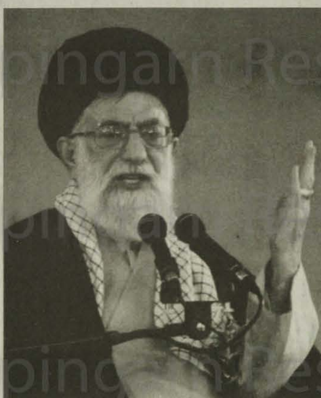
Iran Supreme Leader Ayatollah Ali Khamenei met Thursday with United Nations leaders to talk about the accusations.

Since the United Nations and G-20 meetings last week, the United States and Iran have engaged in serious military posturing. Over the weekend, U.S. Secretary of Defense