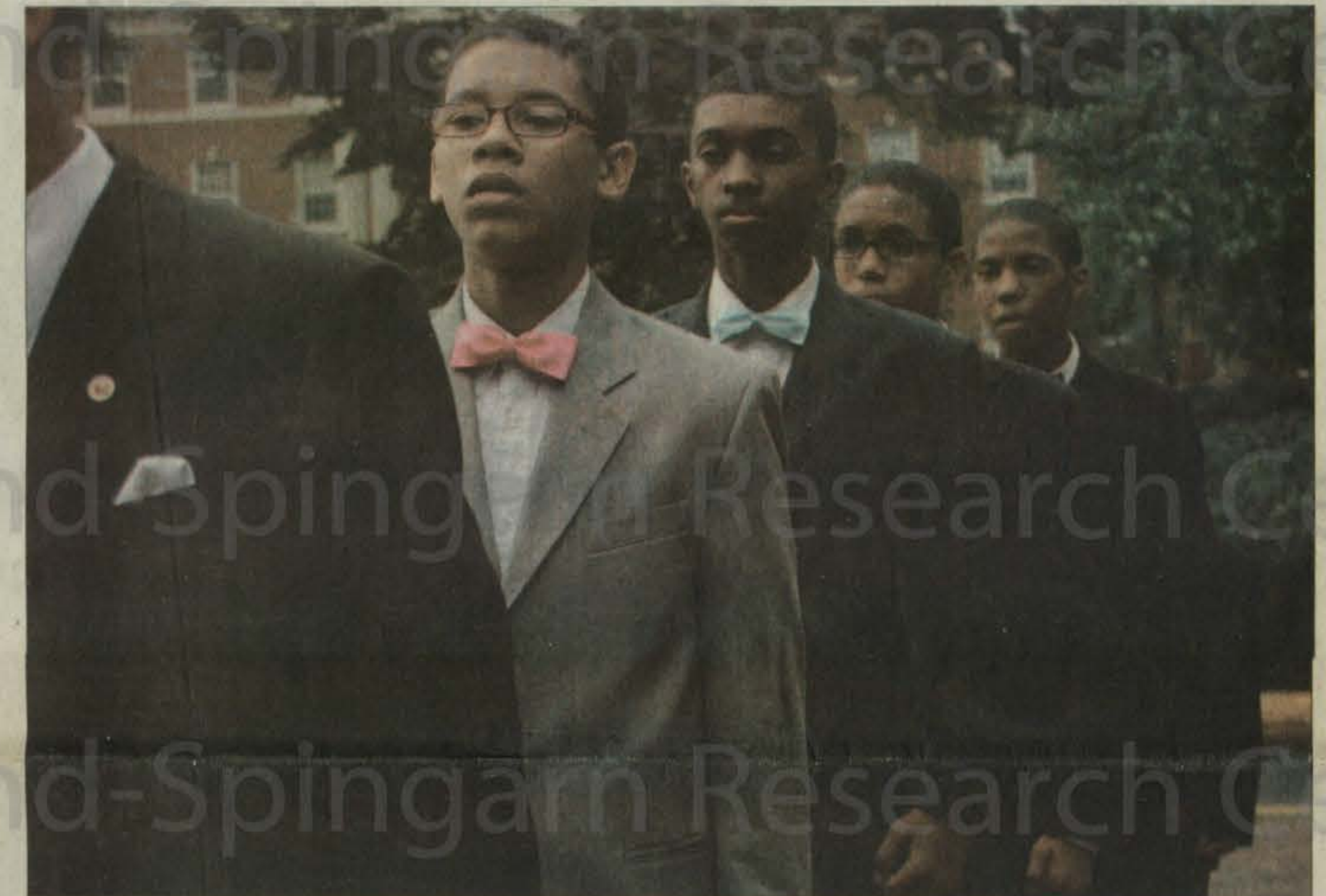
Zelena Williams - Photo Editor

"The Nation of Islam is a nation of peace and righteousness formed for serving the needs of black people and all of human kind. It is the spiritual, mental and economic resurrection of black