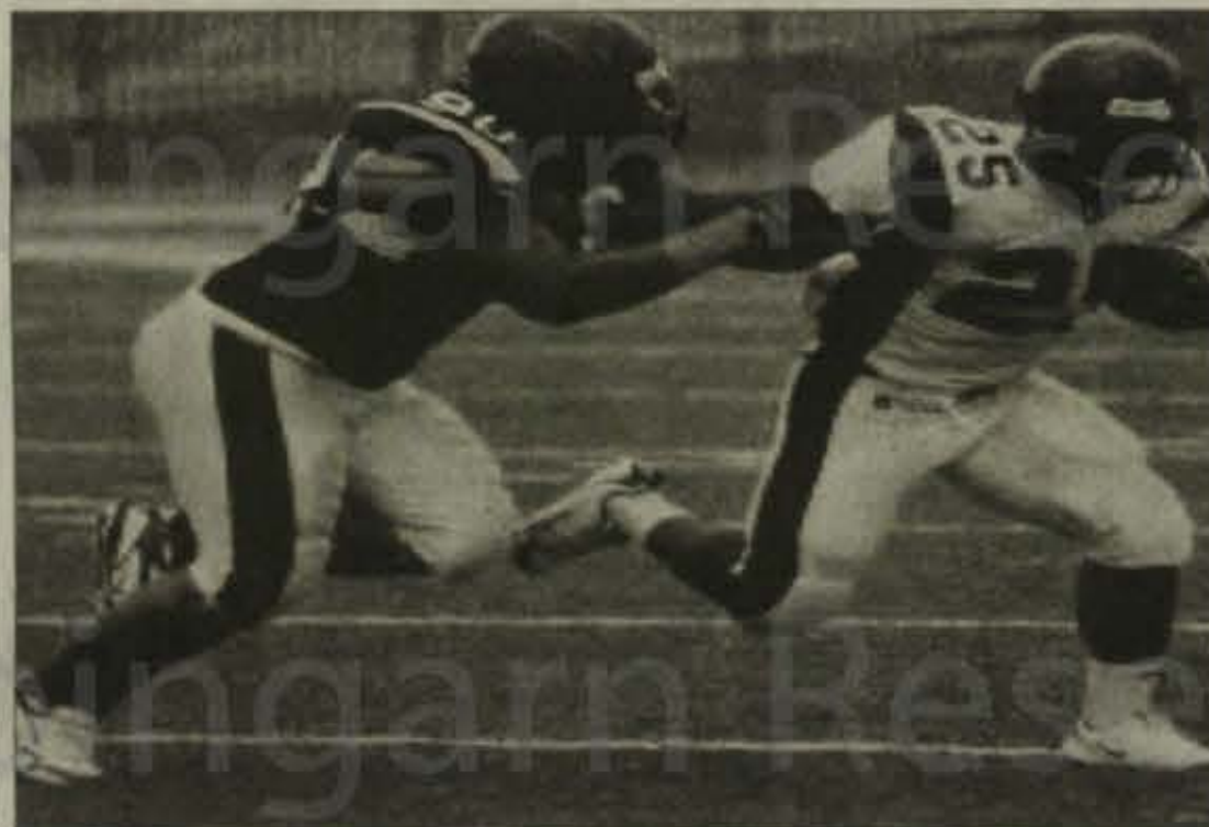
The Bison football team are looking forward to improving on their record of 1-10 last season by having a different attitude towards the game.

"I think the biggest competition will be our first game against Rutgers. They are 1-A and they are ranked No. 18 in the