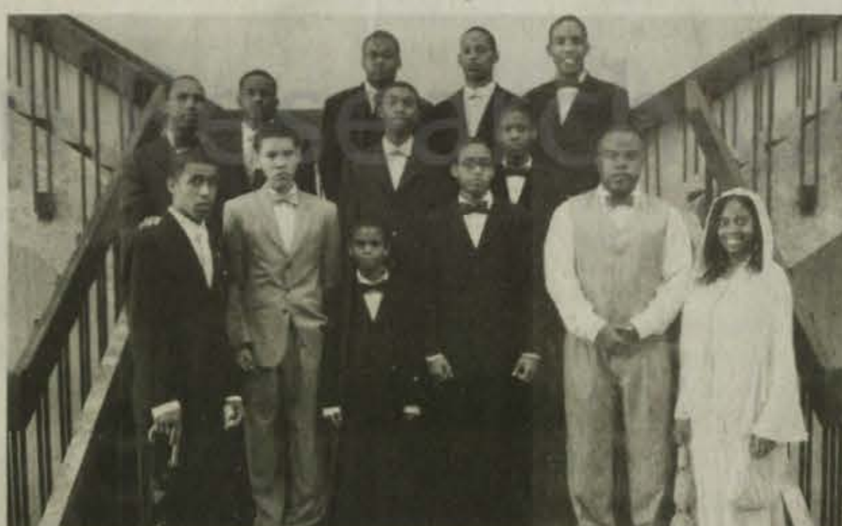
Students from the Nation of Islam Student Association and the Muhammad Mosque No. 7 gathered on the stairs of the Blackburn Student Center.