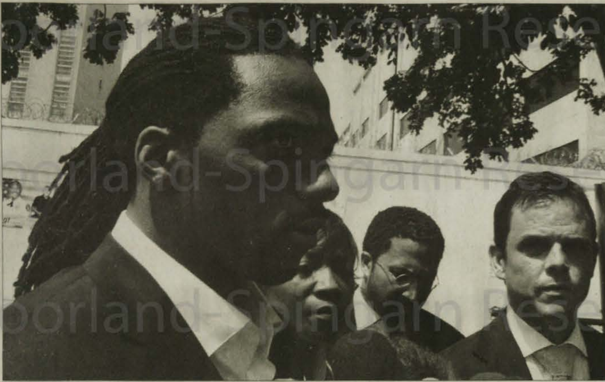
Donte Stallworth speaks with reporters after his court appearance for killing a pedestrian. Stallworth was sentenced to 30 days in jail with six years of probation.