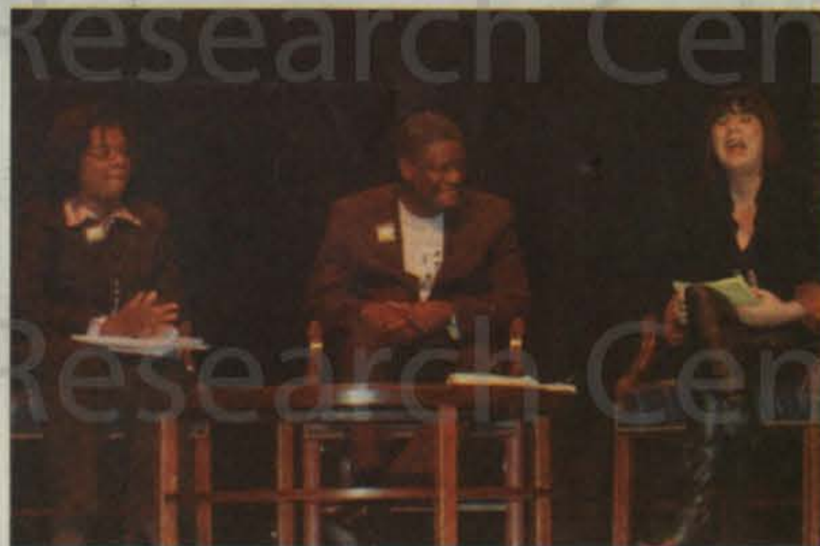
Cramton hosted a panel discussion about violence against women Wednesday night.