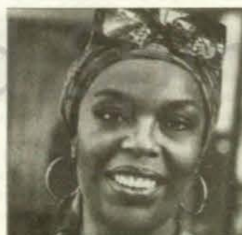
Songstress Roberta Flack became an alumna of HU in 1958.

Words of Advice from Howardites of Yesteryear