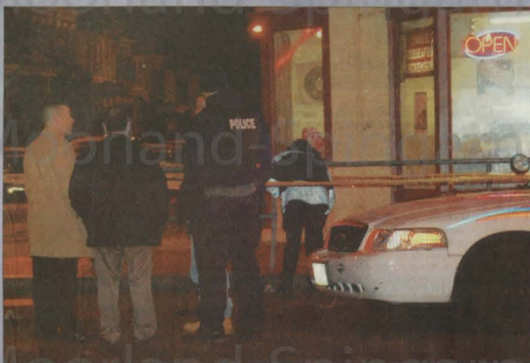
A 22-year-old man was stabbed in front of Howard China late Wednesday afternoon. No one has been arrested and the case is still under investigation.