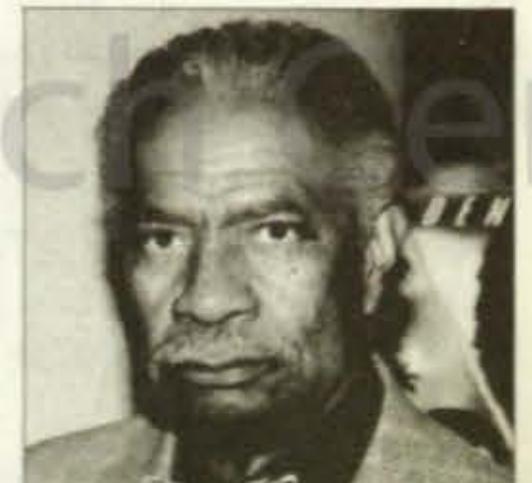
Actor and humanitarian Ossie Davis attended HU in 1939.

"Any form of art is a form of power; it has impact; it can affect change - it can not only move us, it makes us move." -- Ossie Davis, actor, attended Howard in 1939.