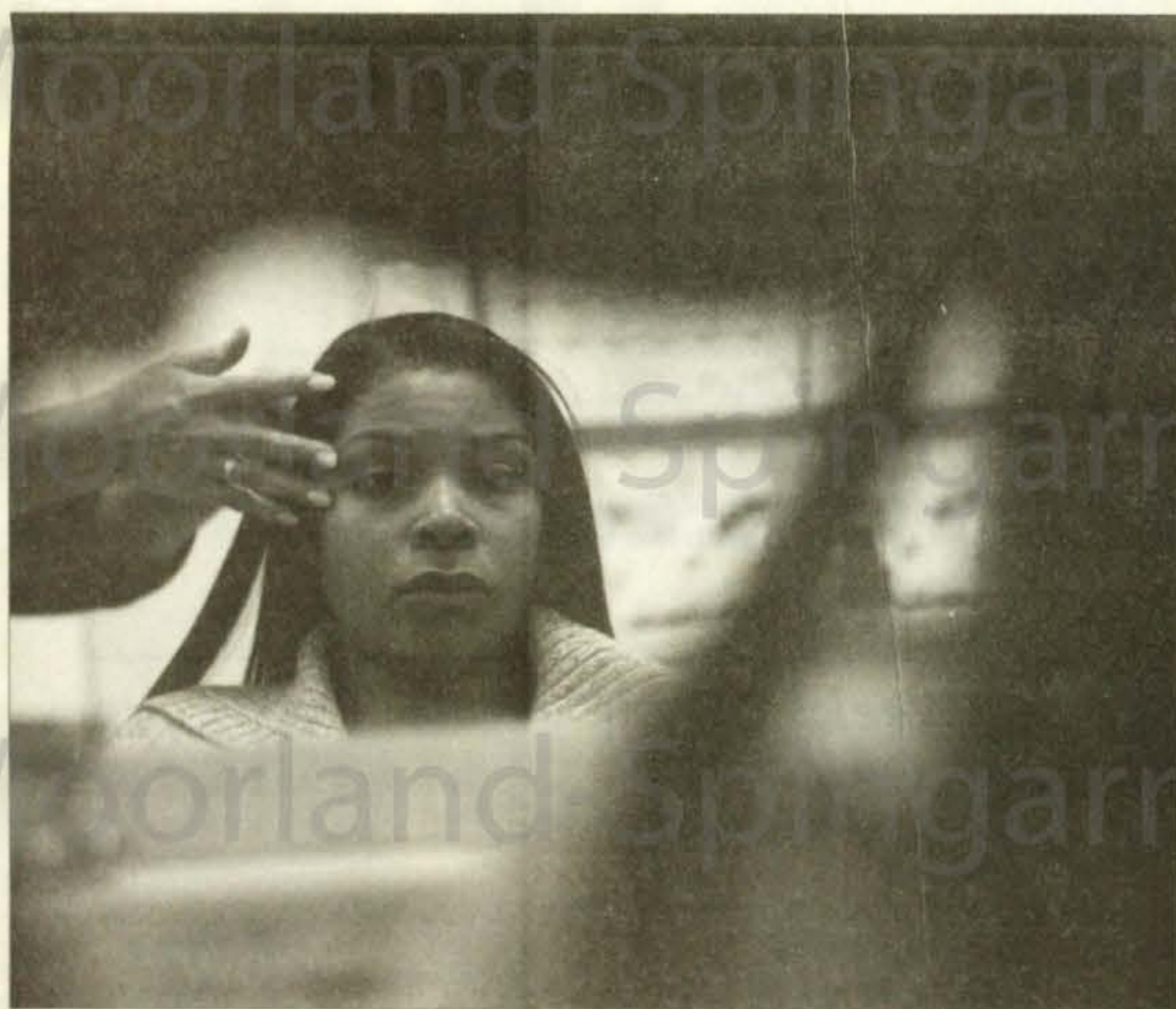
Julie Leonard - Raleigh News & Observer (MCT)

Perms and relaxers are used by some women to get more manageable hair. However, others make the decision to stop using those types of products on their hair because they can be damaging if not done properly.