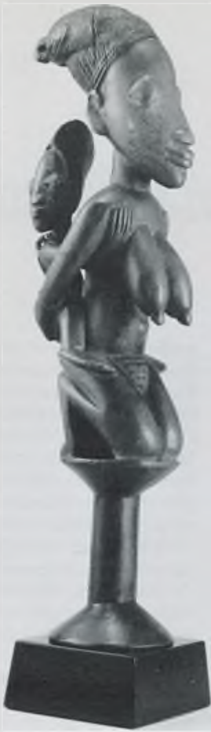
oshe Shango (staff with female figure and child) from the Yoruba peoples, Nigeria Wood, pigment, glass beads