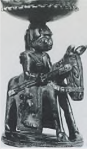
Divination Cup Owo group, Yoruba peoples, Nigeria, 17th-18th century Ivory