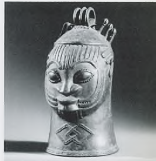
Bell Yoruba peoples, Ijebu group, Nigeria 18th–19th century Cast brass