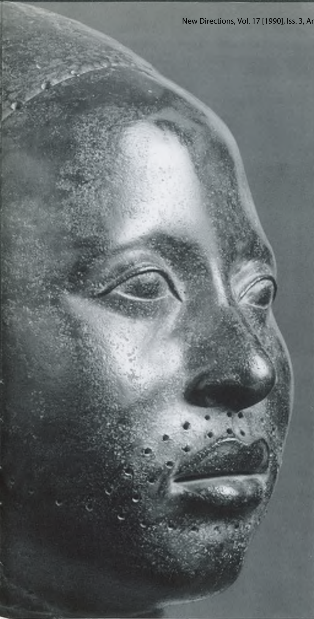
Head of a King Yoruba peoples, Ile-Ife, Nigeria, 11th–12th century Cast brass