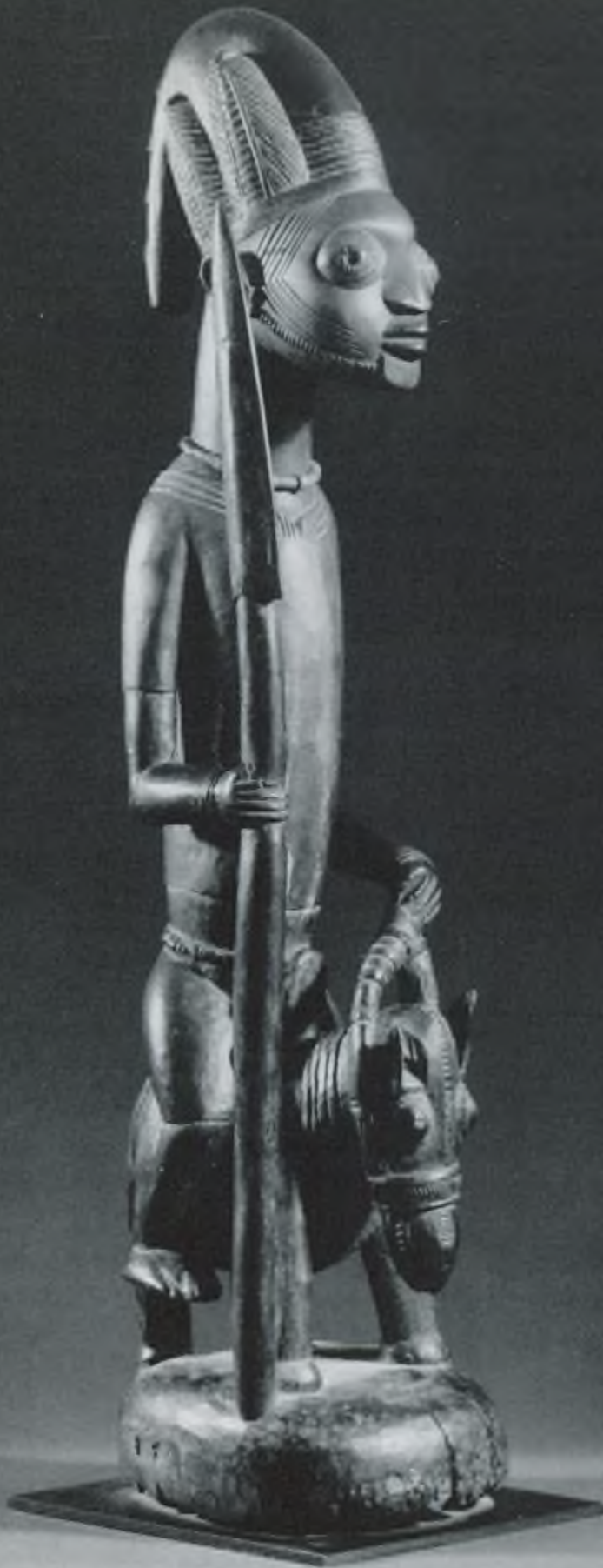
Equestrian figure Artist: Maku (died 1927) Oyo group, Erin, Nigeria, 19th–20th century Wood, indigo dye, glass beads