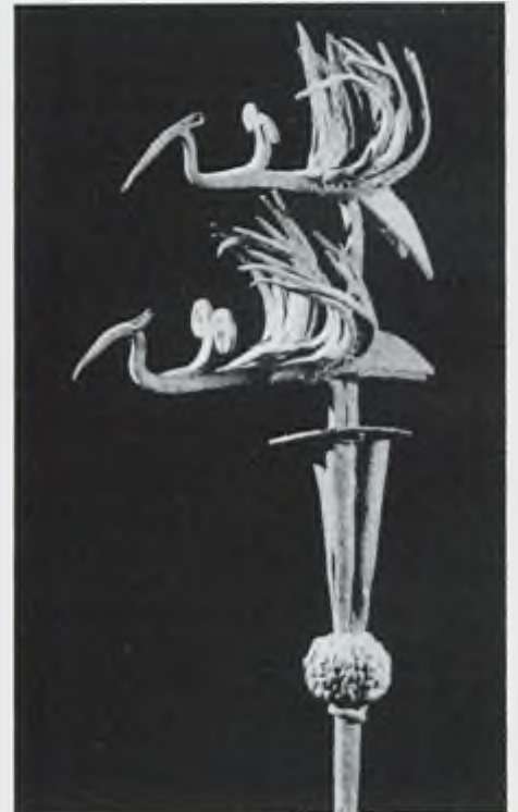
Staff with birds Southern Yoruba peoples, Nigeria, 19th–20th century Forged iron, ritual material