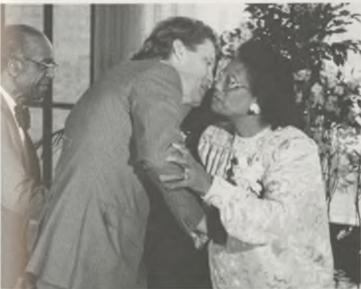
Published by Digital Howard @ Howard University, 1989