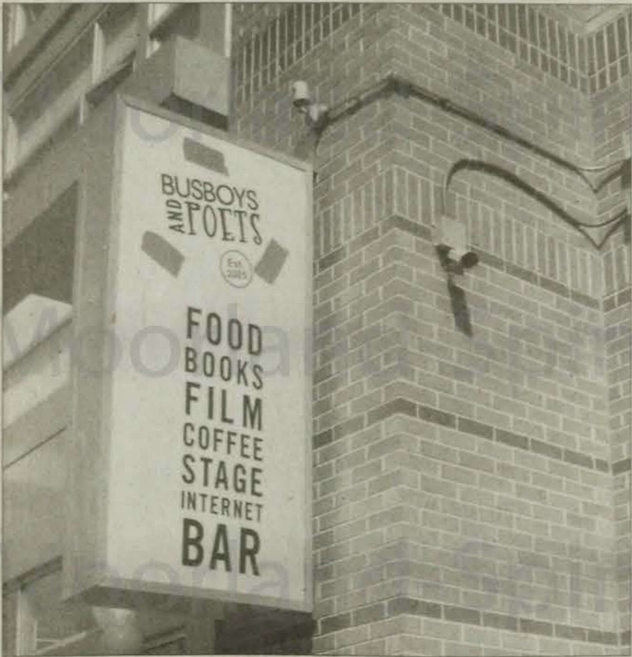
The lounge hosts open night mic on Tuesdays and 11th Hour poetry slam the second Friday of every month.