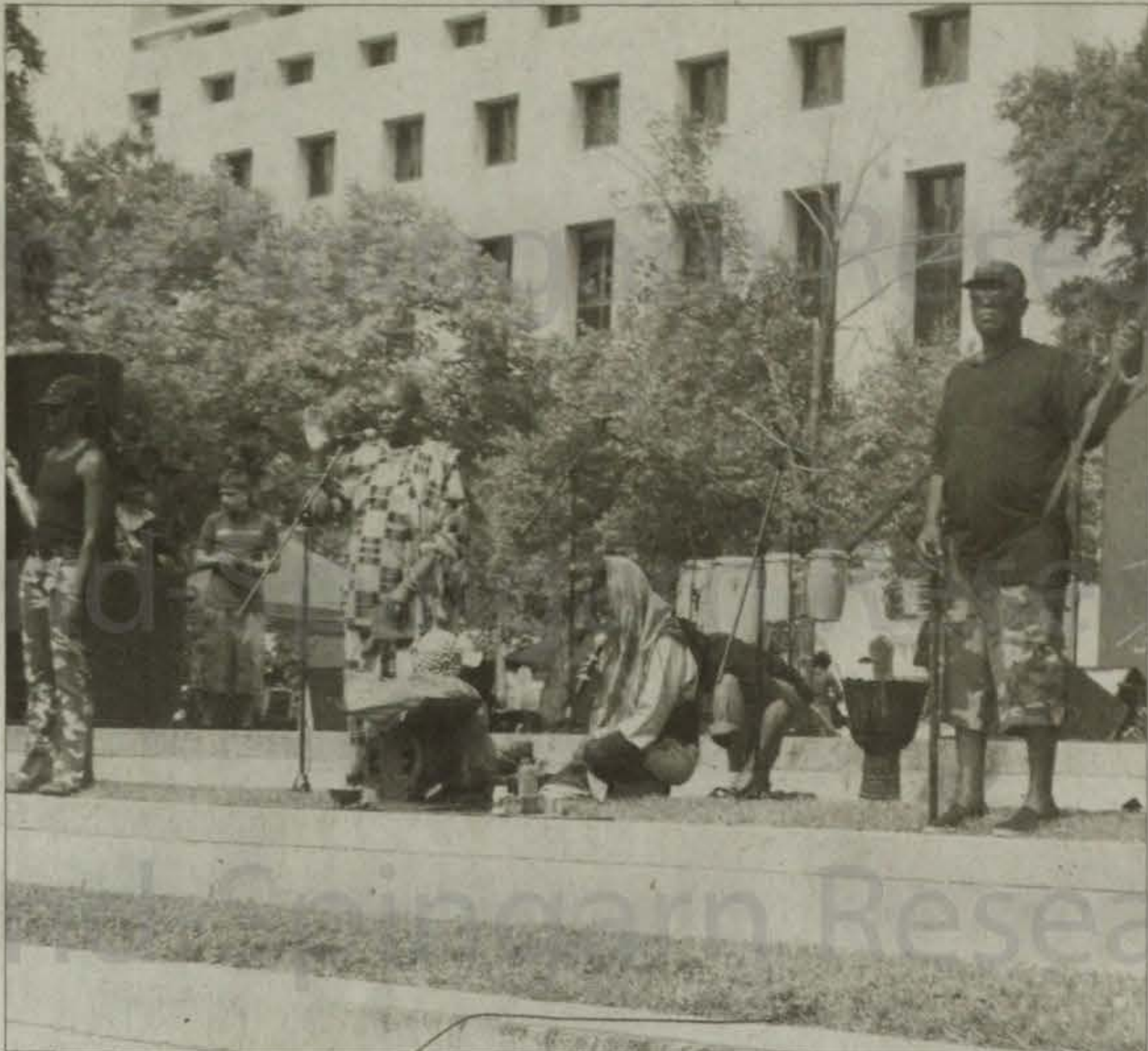
The Black L.U.V. festival began 11 years ago. Over the years, it has grown by the thousands. It gives blacks the opportunity to come together and uplift each other. While attending the festival, one can enjoy tasty food and good music.

While the festival has garnered support from the community for many years, only recently has D.C. displayed its support as well. Last year, the festival received a proclamation from Mayor Adrian Fenty declaring the third Sunday in September