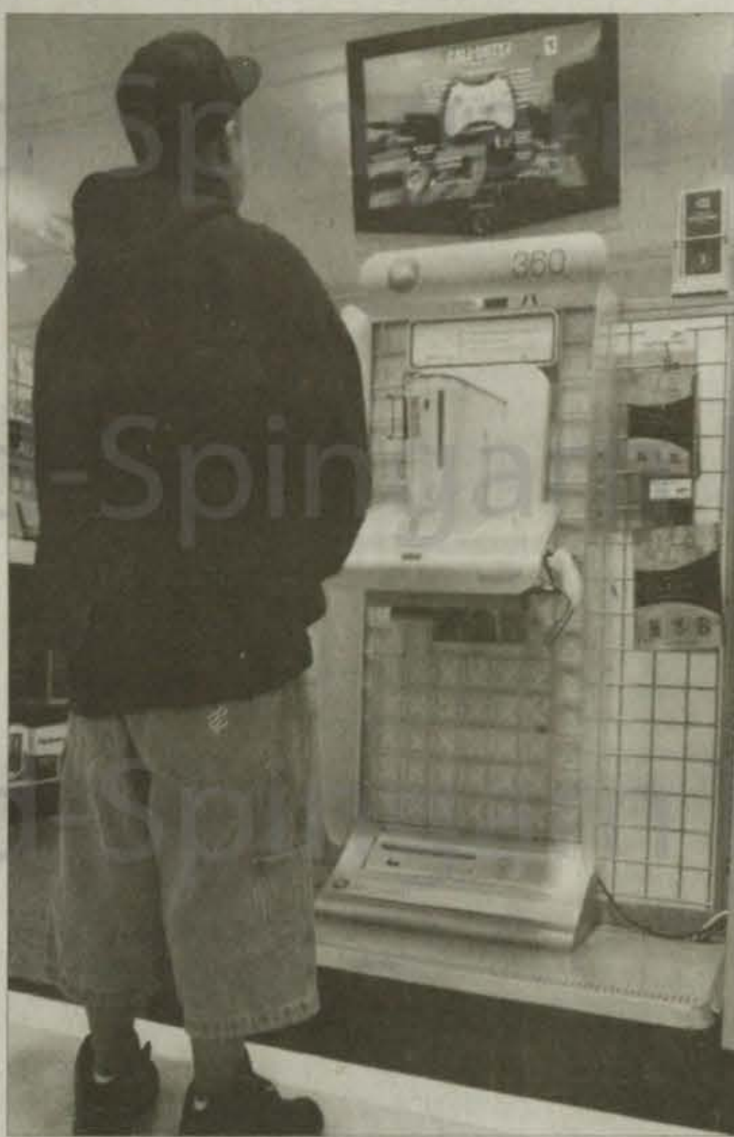
The Microsoft Xbox 360 price decreased from $299.99 to $199 earlier this month. The popular game made its debut in November 2005, facing competitors like Sony and Nintendo.