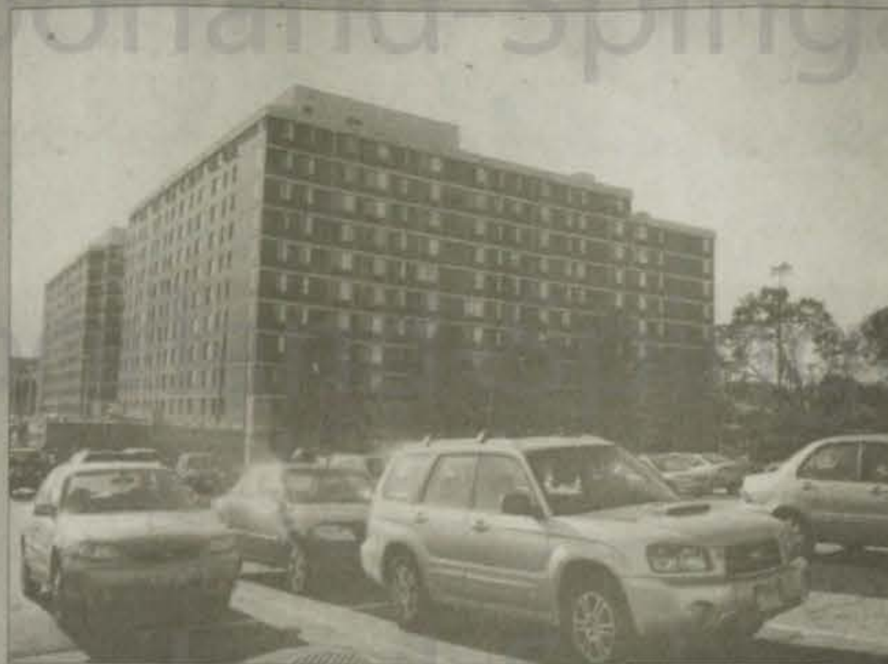
Many students believe the university is not doing enough to accommodate student parking. Others voice concerns with the quality and lack of security in lots such as Banneker North and South.