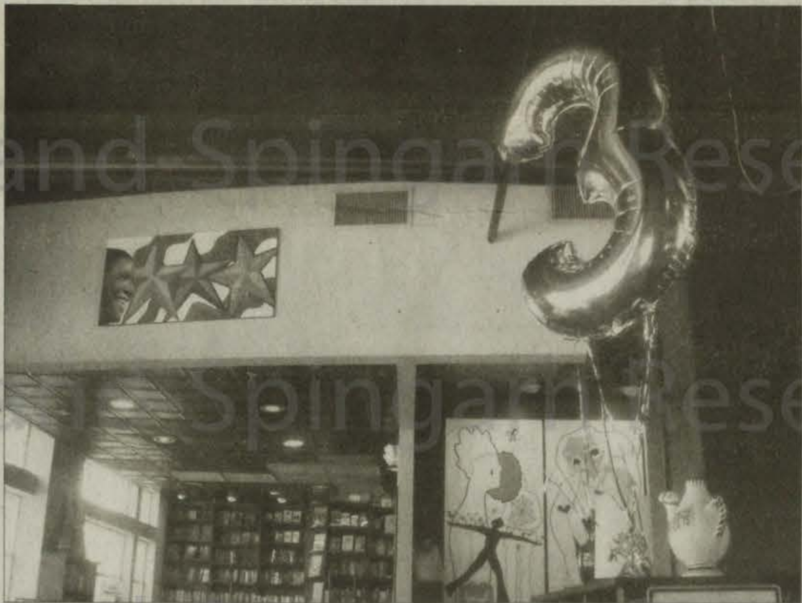
Busboys & Poets, a lounge and popular hang-out spot in the D.C. metro area, celebrated its three-year anniversary on Saturday.

But Busboys & Poets, whose name was inspired by Langston Hughes, is more than just a trendy lounge to bring a date or study on the weekend. In three short years, it has expanded to two new locations because of its captivating passion for community development and peace has caught fire in the metro area—and not to mention its delicious desserts as