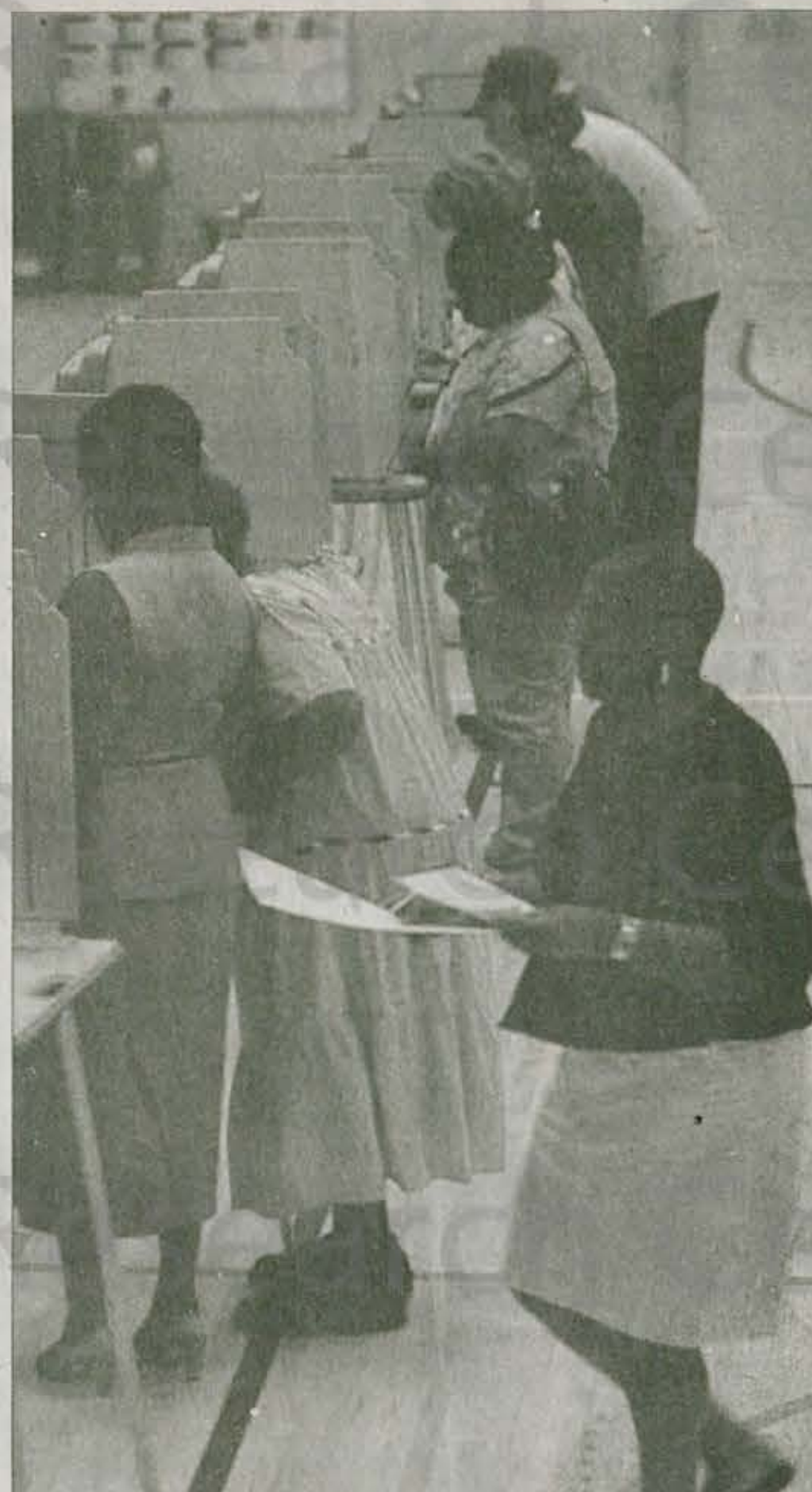
Voters make their way to the ballots on Election Day. Campus organizations will be preparing students to cast their absentee votes this November.

Owen asks students to inform and encourage their friends to go online and to learn about the deadlines.