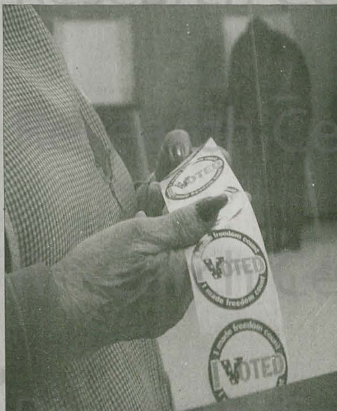
The "I Voted" sticker has become the necessary fashion statement on voting day. Be sure to check your home states Web site for more information on absentee voting.

Myth #3- I missed all the big registration days on campus, and I lost my Howard ID so I can't get into the lab to print out a registration ballot online, so there's no other way for me to register! WRONG! If you have exhausted all possible resources to get your ballot, then you can go to any D.C. Library (MLK in Chinatown), fire station or police station to pick up a registration form.