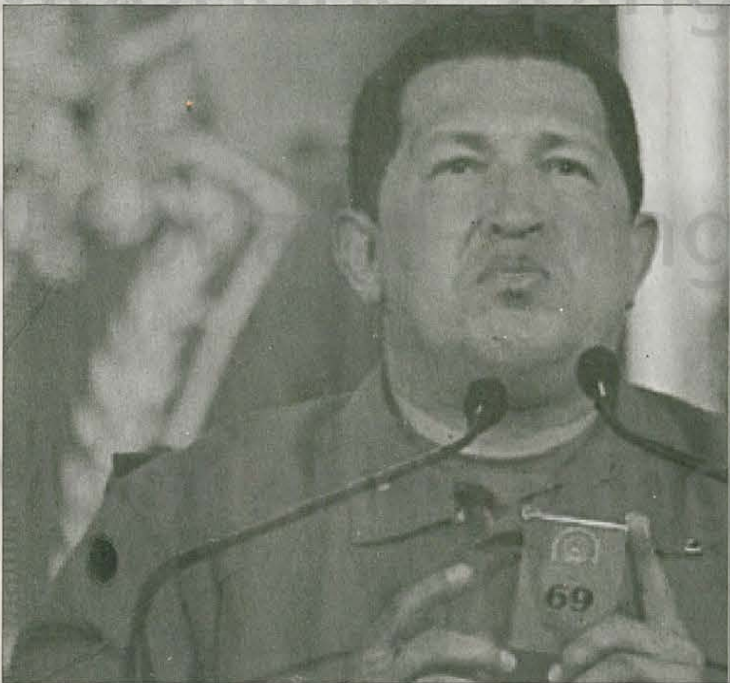
Venezuelan President Hugo Chavez recently announced that there are Russian bomber planes in his country. Venezuela and Russia have become very vocal about their antagonism towards the U.S.