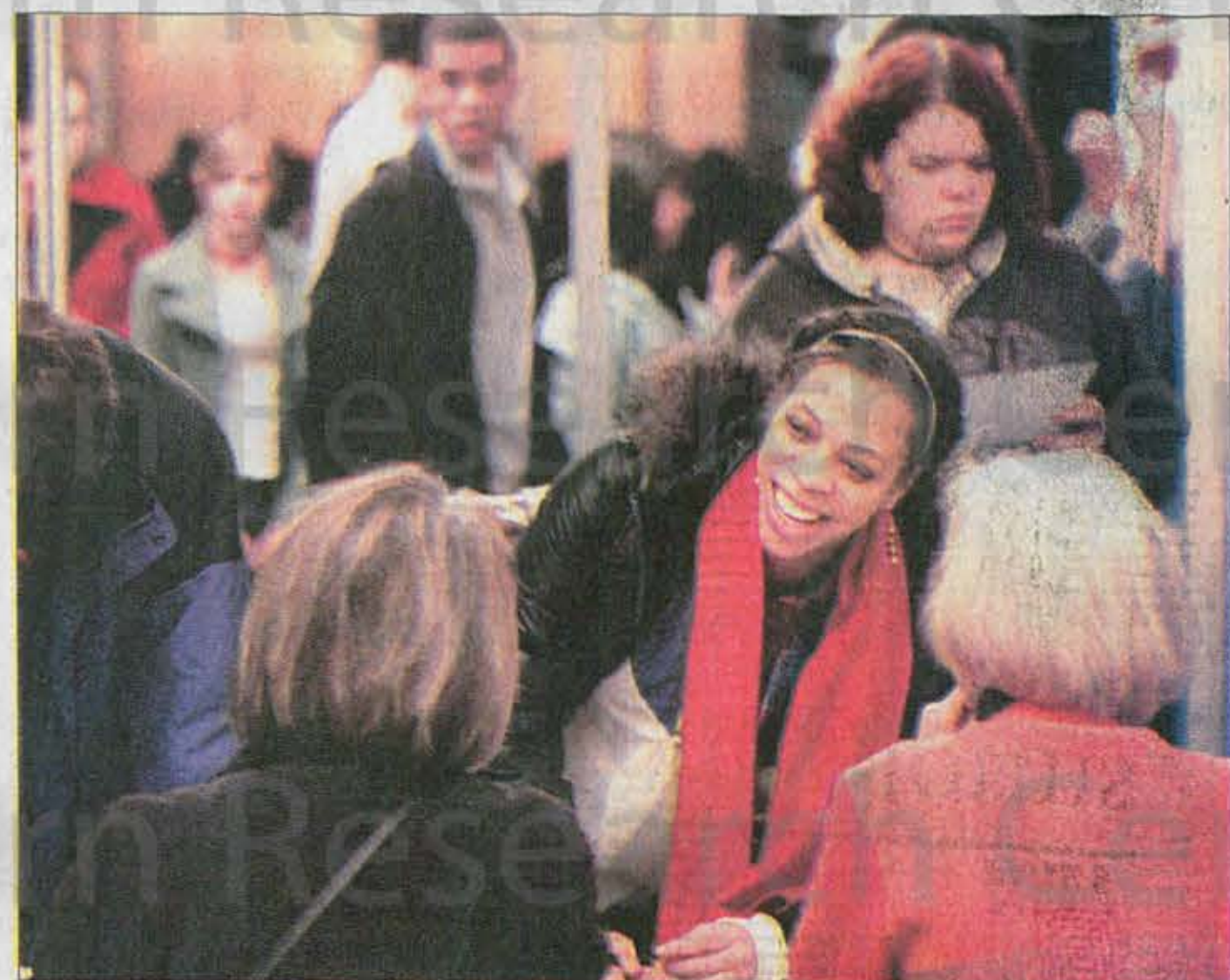
Several campus organizations, such as HUSA and Students Advocating for Youth (SAY), are joining forces in order to register more voters and inform the community about the upcoming elections and issues therein.