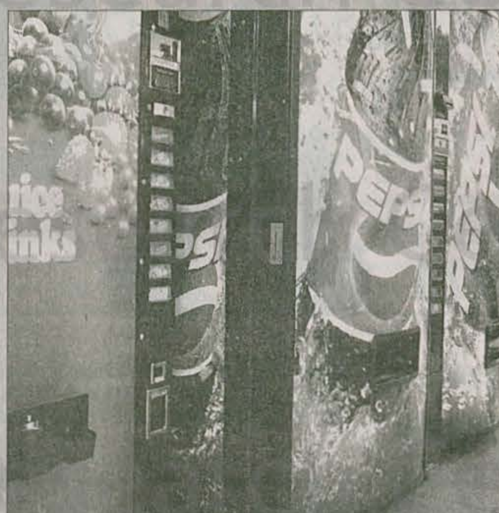
Dale Galden - Milwaukee Journal Sentinel

-Compiled by Travis White, Staff Photographer