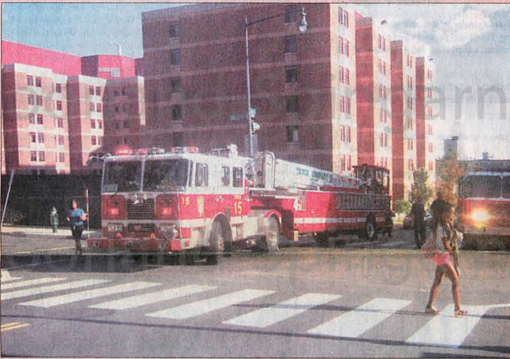
D.C. Firefighters on their way to College Street prepare to put out a fire reportedly caused by a cigarette not being put out properly.

"We're going to look to our alumni at middle and senior management levels in this industry," she explained. "And we are going to use our alumni database. One of the things we are doing is bringing students along so that they will have the opportunity to work with people in the industry. So that they may have the opportunity to intern and have a mentor."