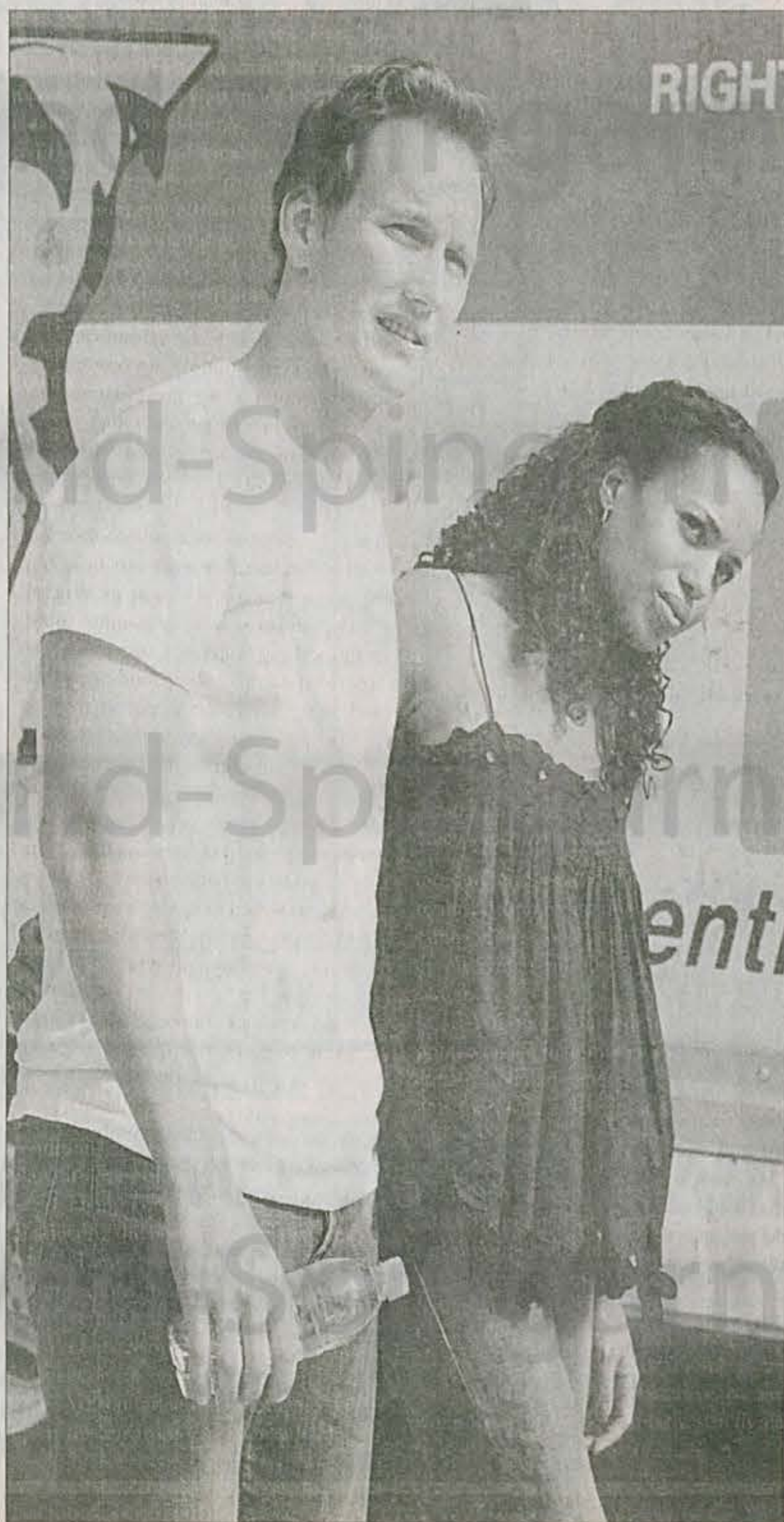
Patrick Wilson (left) and Kerry Washington (right) play an interracial couple in the upcoming film "Lakeview Terrace" opening in theaters Sept. 19.

Actress Kerry Washington stars in new film that addresses racially motivated harassment