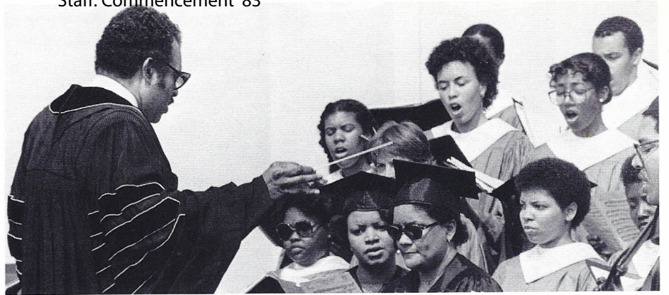
Staff: Commencement '83