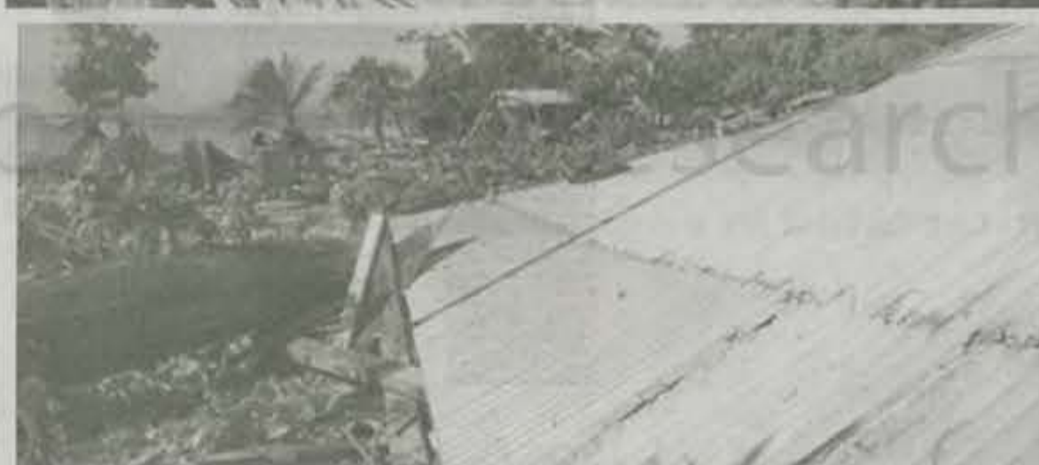
The island of Gizo, part of the Solomon Islands, is a tourist destination known for its coral reef, among other things. Monday's Tsunami hit Gizo the hardest of the chain of 200 islands.