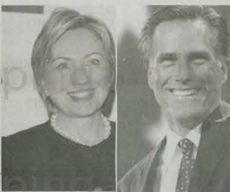
Sen. Hillary Clinton (D-NY) and Massachusetts Governor Mitt Romney from the GOP have emerged early as top fundraisers.

touring Iraq, told The Associated Press that he remained "cautiously optimistic" despite the low numbers.