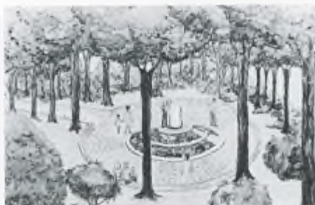
Sketch of slave memorial at Mount Vernon

"The memorial that we dedicated stands in testimony not only to the cooks, carpenters, masons, stockhands, maids, groundskeepers, boatmen and others who worked and maintained the home of the nation's first president, but also to the roots of the Afro-American presence in the continuum of America. Recognition of this presence brings with it a responsibility that is expressed eloquently by Mary McLeod Bethune: 'We are the custodians as well as the heirs of a great civilization.'"