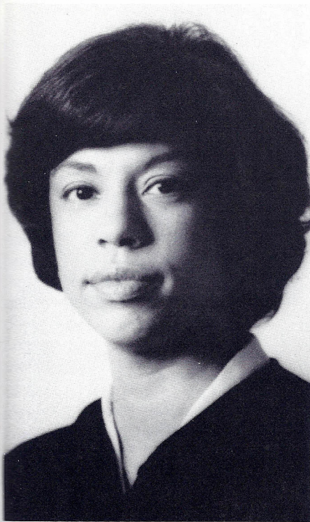
Gabrielle Kirk McDonald