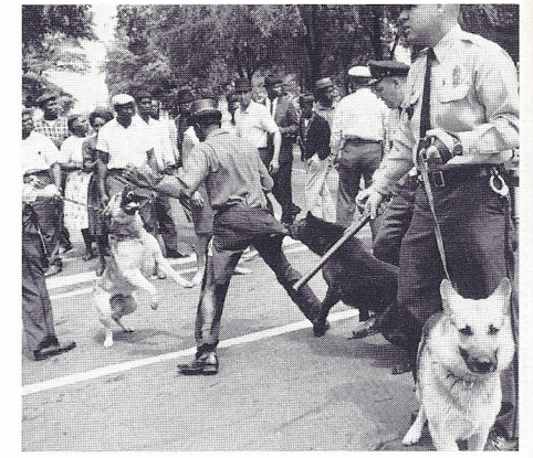
BY CHARLES MOORE, 1963