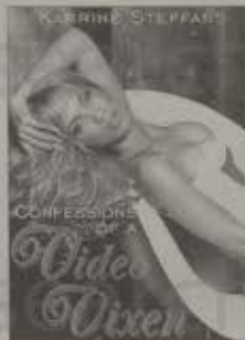
Recent reports suggest Elise Neal (right), former star of UPN Networks sitcom "All of Us" and the movie "Hustle and Flow" has been tapped to play the role of Karrine Steffans in the movie based on the book "Confessions of a Video Vixen."