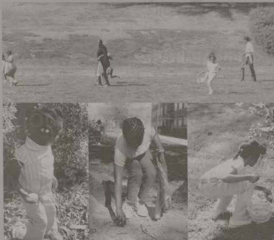
The first Howard Kids Easter Egg Hunt was held in the Valley on Saturday. The event allowed local children to partake of the traditional holiday past time and interact with Howard students. The day's activities were sponsored by the Howard University Student Association, Groove Phi Groove and Endustry Power Players.