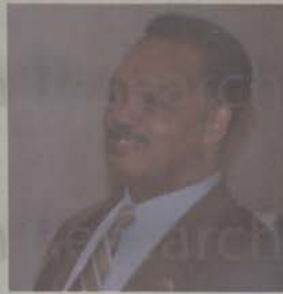
Recent DNA tests have come up negative, and Jackson says his coalition will pay the student's tuition, regardless of the veracity of her claim.

Pictures from a digital camera used the night of the attack were obtained by a