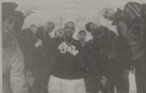
Artists like M.L.A. from Britain and the rappers Fonky Family (above) are using hip-hop to tell stories of difficult childhoods and life struggles.

M.L.A.'s debut album "Arular" named after her father's revolutionary alias, is taking the world by storm and has even caught the attention of American hip-hop icon Nas, who called her "the future."