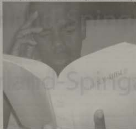
A recent study by the Higher Education Research Institute (HERI) at UCLA found that African-American students have a greater tendency to believe in God, pray and attend services.

communities. It was the place where you saw black men in suits and women smiling brightly. Church was an escape from racism, where the community could assert itself and hold positions of power. But those community centers have grown into mega churches that check W-2's to calculate member's tithes and own strip malls. The churches