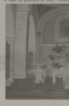
Some students are seeking to find their spirituality outside of church. Studies show that attendance in religious services went down as they matriculated.