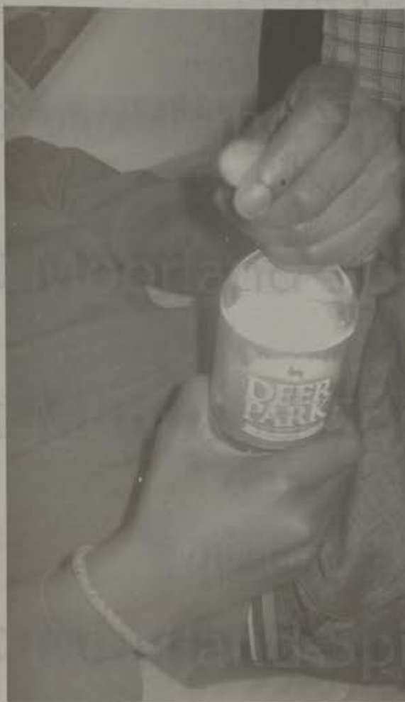
Students prefer bottled water as a safety precaution, as well as the convenience while on the go.

BY NICOLE L. PHILLIPS Contributing Writer