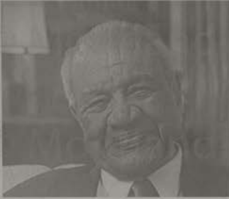
Chapel speaker Rev. Dr. Gardner Taylor has been hailed as one of the greatest preachers in American history and received a Presidential Medal of Freedom in August 2000.