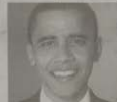
There's presidential buzz surrounding (clockwise) Sen. Hillary Clinton, Sen. Bill Frist, Sen. John McCain and Sen. Barack Obama

to the former POW and Vietnam vet as "unstable," while courting the right-wing conservatives of his party that he previously avoided.