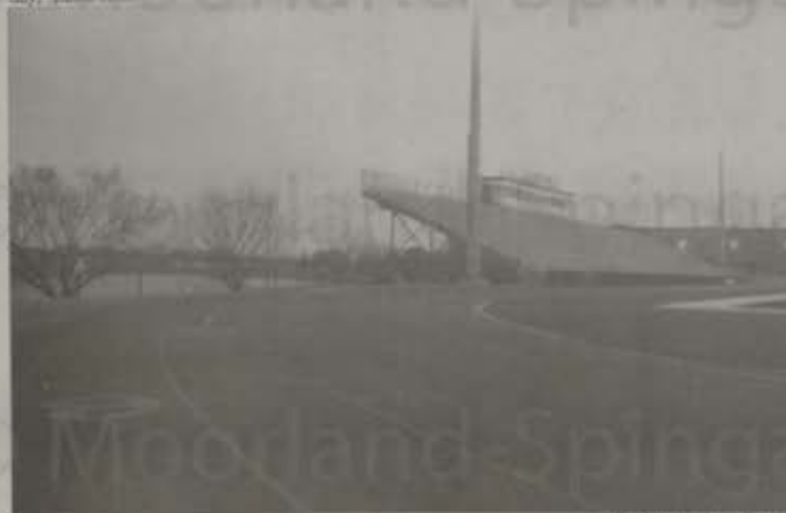
The track at Greene Stadium is one of Howard University's athletic facilities in need of repair and has not been renovated since 1986.