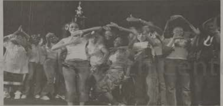
The Tubman Quadrangle was crowned ResFest champion for the second year in a row at Friday's ResFest Talent Show. Meridian Hill Hall won the talent show while Drew Hall came in second place.

"I had a really good time this year, this is my fourth year participating and my third year participating as an RA," she said. "ResFest is one of the most positive things that happens at Howard and students should take advantage and get