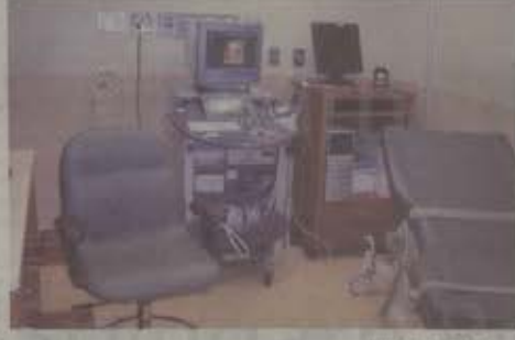
Howard University Hospital showcased three sonogram rooms equipped with technology that will display 3-D and 4-D images on 27-inch flat screen monitors in the hospital's Perinatal Diagnostic and Ultrasound Center.

The Perinatal Diagnostic and Ultrasound Center provides specialized care to women