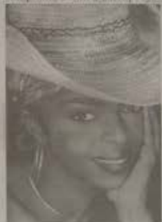
The rapper/singer Lauryn Hill, is back in the studio with the rest of The Fugees recording their reunion album.

Kweli sensitively explores the way her unwillingness to compromise with a corrupt sys-