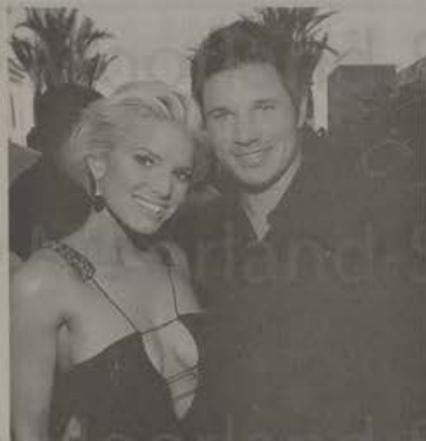
Jessica Simpson and Nick Lachey, formerly of MTV's "Newlyweds," recently split in the pattern of many hollywood relationships.

"For better or for worse," Til death do us part..." these words no longer have the value they once did. In Hollywood, it seems to be that when things get a little rough, or the public is no longer interested, celebrities are quick to divorce the one they were supposed to spend the rest of their lives with.