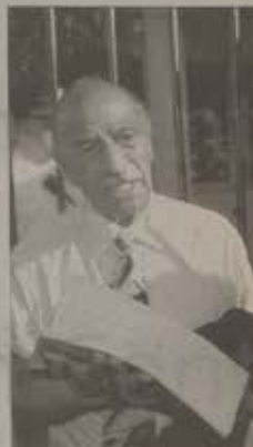
Aides of Representative John Conyers of Michigan are alleging that he engaged in unethical behavior. They say Conyers required them to be nannies and tutors to their children.