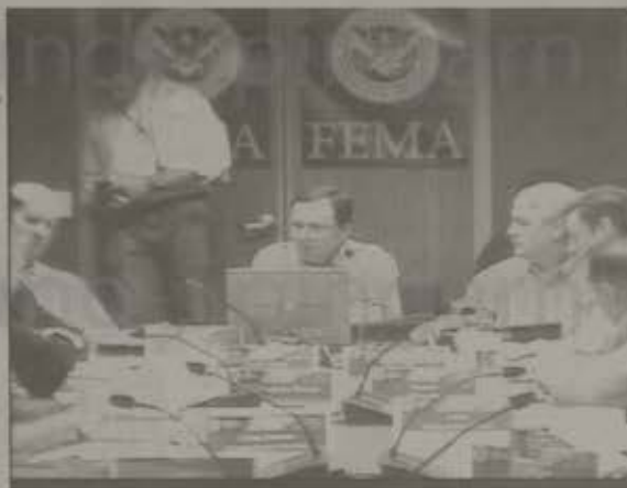
A newly released tape shows a video conference showing that President Bush was briefed about Hurricane Katrina threats. The Aug. 29 conference was hosted by Vice-Director of FEMA Michael Brown.

Homeland Security Michael Chertoff agreed with Bush saying, "that perfect storm of a combination of catastrophes exceeded the foresight of the planners and maybe anybody's foresight." He called the disaster,