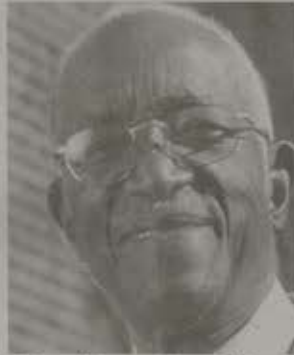
John Hope Franklin, 2001

Each year, Howard University celebrates the day that General Oliver O. Howard of the Freedman's Bureau, founded the institution in 1867. At the ceremony held in Cramton Auditorium, officials select renowned and informative speakers to deliver the keynote speech to encourage students to carry on the legacy that is Howard University. These are the men who received this honor in the 21st century.