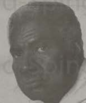
Ossie Davis, 2004