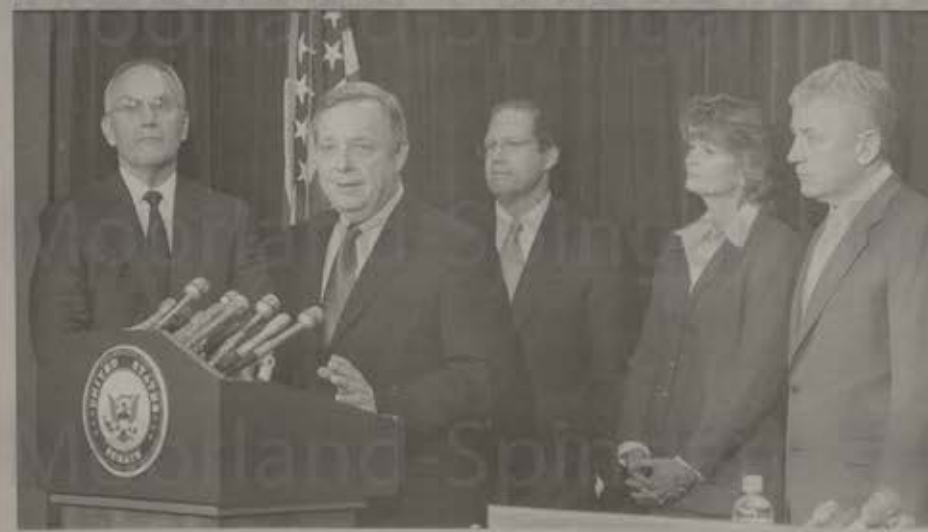
Senator Richard J. Durbin (D-Ill.) explains at a hearing why he favors the Patriot Act. Also with him are senators Larry E. Craig (R-Idaho), John E. Sununu (R-N.H.), Lisa Murkowski (R-Alaska) and Chuck Hagel (R-Neb.)

Conyers, 76, serves as the senior minority member of the House Judiciary Committee.