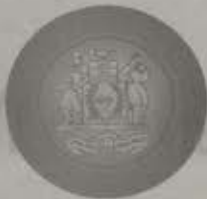
NC A&T Receives Grant to Curb Smoking

Student smoking has become such a major issue at North Carolina A&T University that the school has received an $80,000 grant from the North Carolina Health and Wellness Trust Fund to help curb the growing trend. The initiative was created through research conducted by the dean of A&T's nursing school along with the dean of nursing education. The program will be led by student leaders who will promote to the general student body the program's two main goals: to promote greater smoking awareness and to bring about change to university policies regarding smoking.