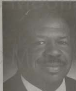
Elijah Cummings, 2003