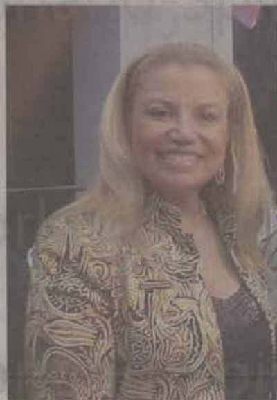
Entrepreneur and media mogul Suzanne De Passe will speak at Convocation today.

She has received numerous honors for her accomplishments, including the American Women in Radio and Television Silver Satellite Award (1999), Women in Film Crystal Award (1958), and she was inducted into the Black Filmmakers Hall of Fame in 1990.