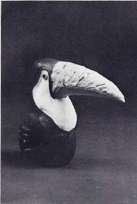
Bird Container (1976)

Media: glass, plastic, cowhide, pigskin, laminated suede