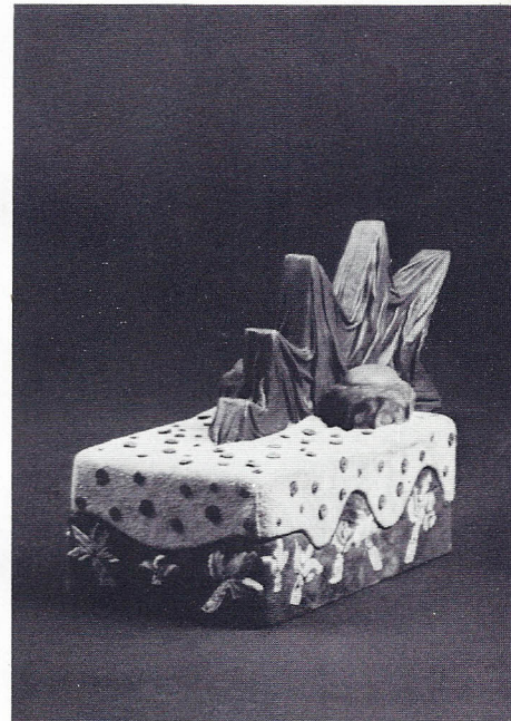
Dragon Box (1980)

Media: wood, plastic, plaster gauze, cowhide, snakeskin, ostrich skin print on cowhide, rope, jute.