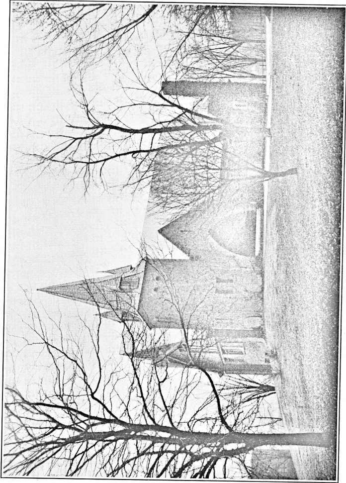
The Chapel at Howard University