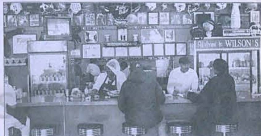
Wilson's has been serving the D.C. community since 1994.