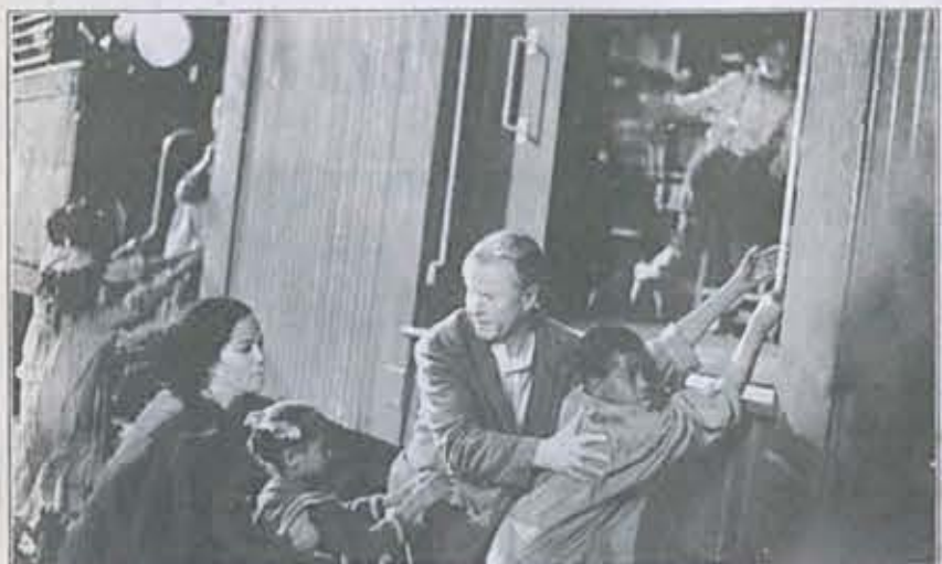
Character John Wright (center) helps Rosewood survivors board train in movie.