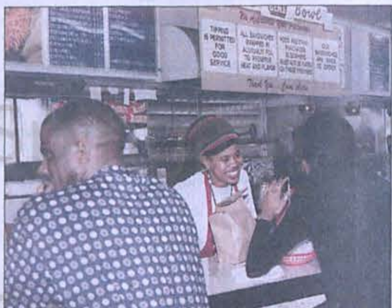
Ben's Chili Bowl, also located on U Street for several generations, continues to serve good food.

Miller gazed out the window of historic Ben's Chili Bowl, as