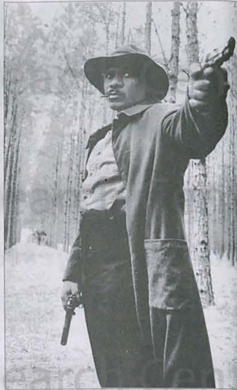
Ving Rhames stars in "Rosewood," Warner Bros.' searing drama based on an actual story.