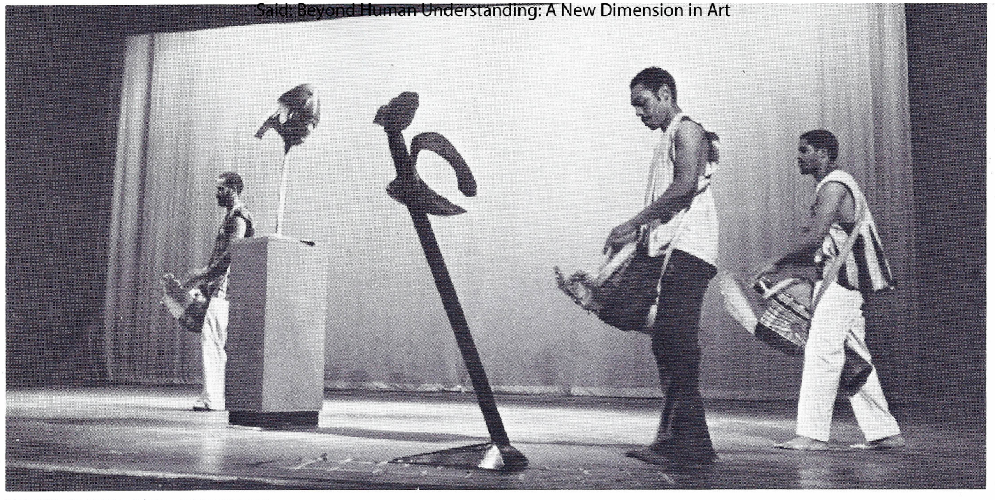
"Back to the roots – Africa – " with on-stage performance of "talking drums."