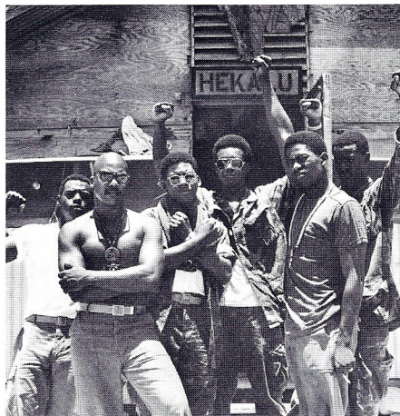
In Chu Lai , South Viet Nam, militant Black Marines raise clenched fists before the hooch they call "Hekalu" from the Swahili language. Reacting to cross burnings and other signs of racism, the Marines organized chapters of the Ron Karenga "US" movement throughout South Viet Nam.