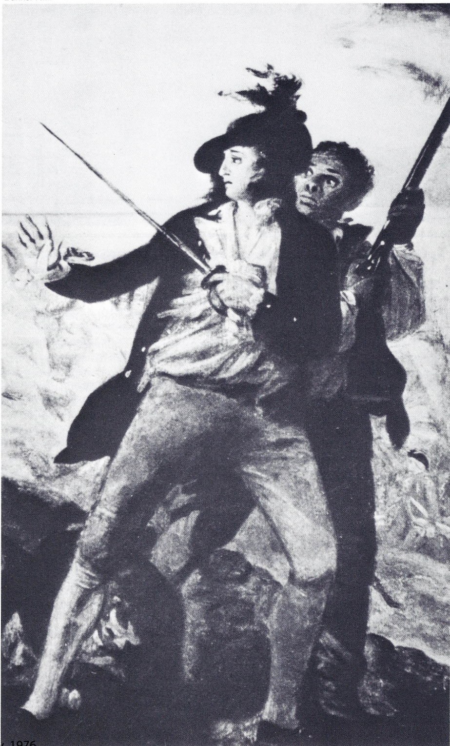
Peter Salem with Lt. Grosvenor at the Battle of Bunker Hill.

My toy guns were useless in the ghettos of Harlem and Indianapolis. "You gotta be the Indians," some white kid would tell me. "You gotta be the Japs." Why? "Cause you're a darky just like them." Black children grew up for so long in America losing