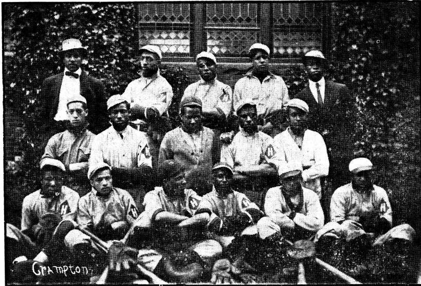
THE INVINCIBLE PREPS BASE BALL TEAM.