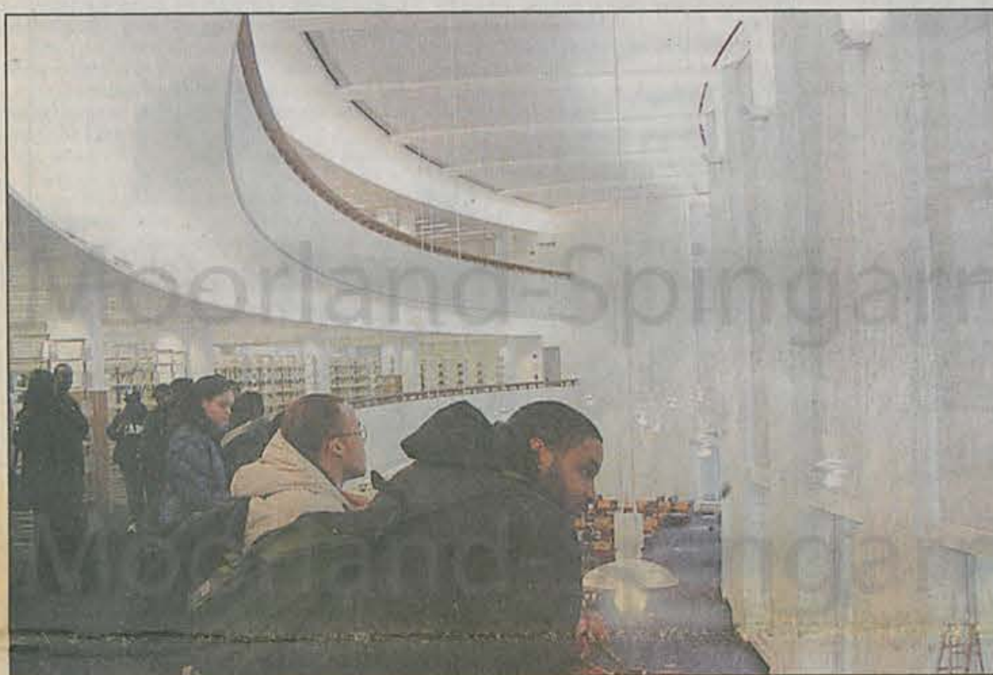
Students who toured both the Law and Health Sciences Libraries said that the inside of the Law Library, left, was both inspiring and impressive.