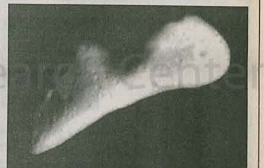
On Tuesday, NEAR became the first space probe to ever land on an asteroid. Eros (the asteroid) is 21-miles long.

CASTRIES, ST LUCIA - St. Lucia's Prime Minister, Dr. Kenny Anthony, will lead a discussion on three issues of critical importance to the region's future when Caribbean Community and Common Market (CARICOM) leaders hold their 12th Inter-sessional Meeting in Barbados next week. The three issues going before the February 14-16 summit relate to the proposed Caribbean Court of Justice (CCJ), the region's bread-and-butter tourism industry, and the vexing problem of crime, which has become a major challenge for CARICOM governments in recent years.