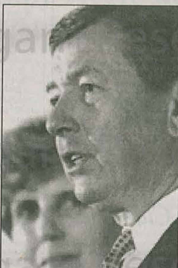
Attorney General John Ashcroft settled into his new cabinet position this week.

"Norton's nomination is a giant reward to the oil, gas, and mining industries that funded President