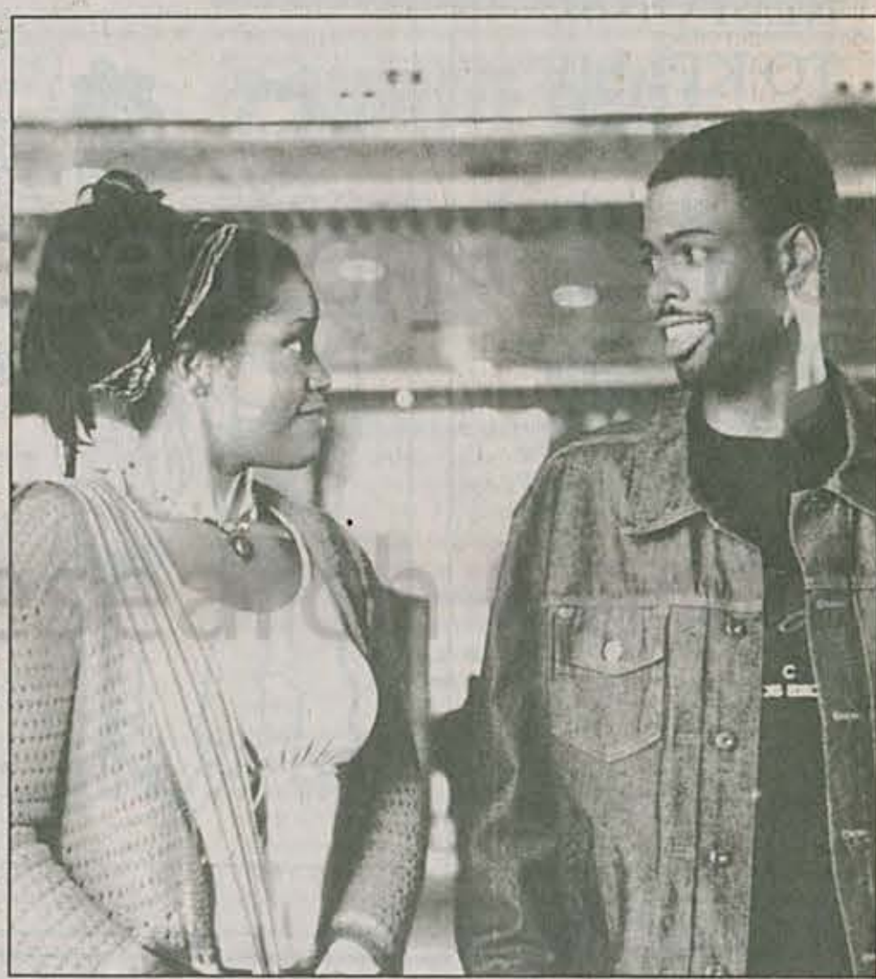
Chris Rock proves to Regina King that he's pretty fly for a white guy in "Down To Earth."

Down to Earth has its ups and downs but mainly its ups. Rock gives a comedic performance with merit while Sykes steals the show. The characters are definitely complex and lovable. "Down to Earth" has a share of surprises and a cute love story intertwined. This weekend is definitely going to be a weekend at the box office where Chris Rock might be able to battle Hopkins' "Hannibal" and bring him back down to earth.