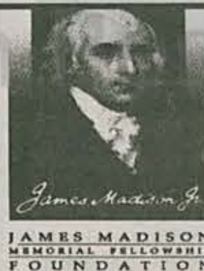
JAMES MADISON MEMORIAL FELLOWSHIP FOUNDATION

The Pulmonary-Critical Care Medicine Branch at the National Institutes of Health is looking for individuals with asthma between the ages of 18-65 to participate in a 3 to 4 day research study. A thorough medical evaluation and monetary compensation will be provided. If interested, please call (301) 402-1553.