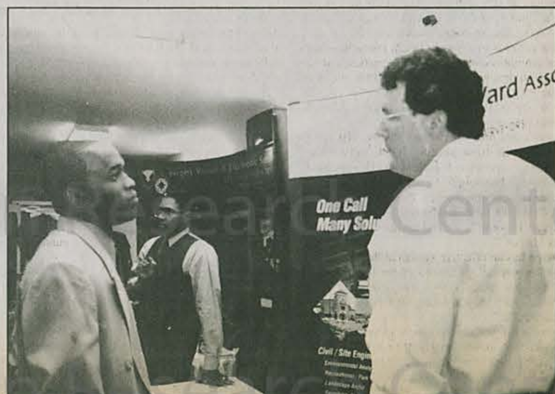
Students submitted resumes, filled out application and interviewed in hopes of finding employment during the job fair last Thursday.