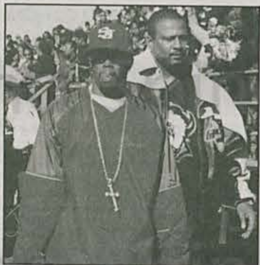
File Photo Rap Mogul and Howard alum Sean "Puffy" Combs is seen here at the 2000 Homecoming game.

Combs was charged with second-degree posses-