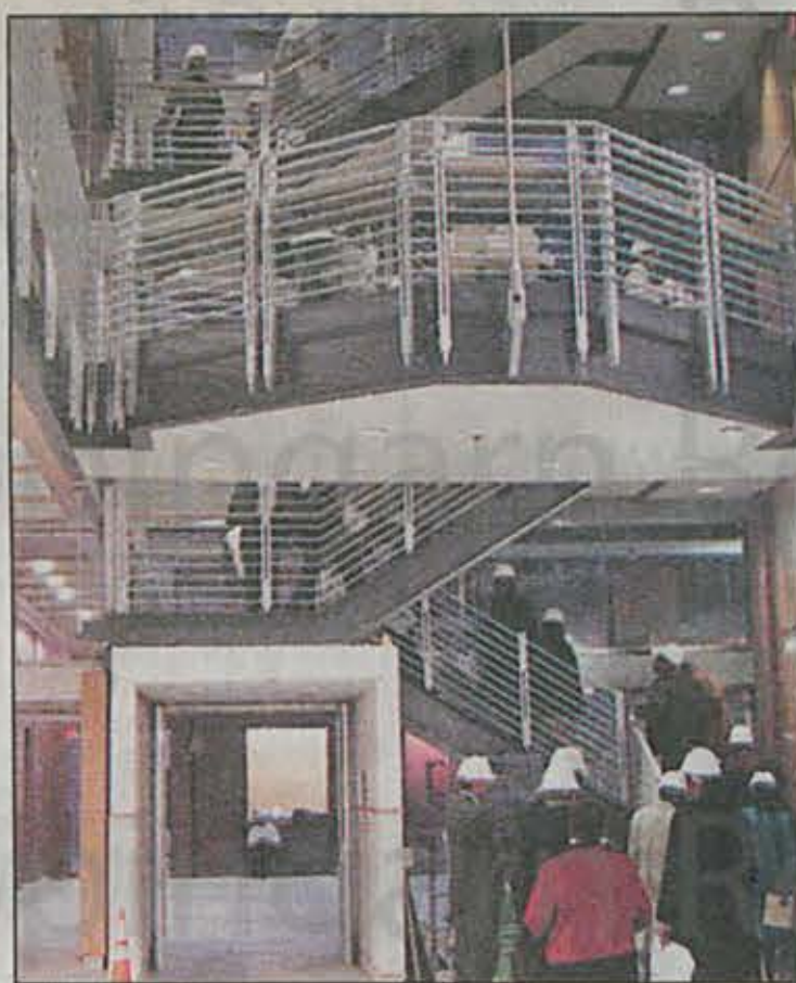
Students tour the Louis Stokes Health Sciences Library

That is not all, however, that makes the new Law Library impressive. Nearly every room is provided with wall-to-wall and floor-to-ceiling windows that show attractive views of nearby Rock Creek Park. Please See Libraries, A3