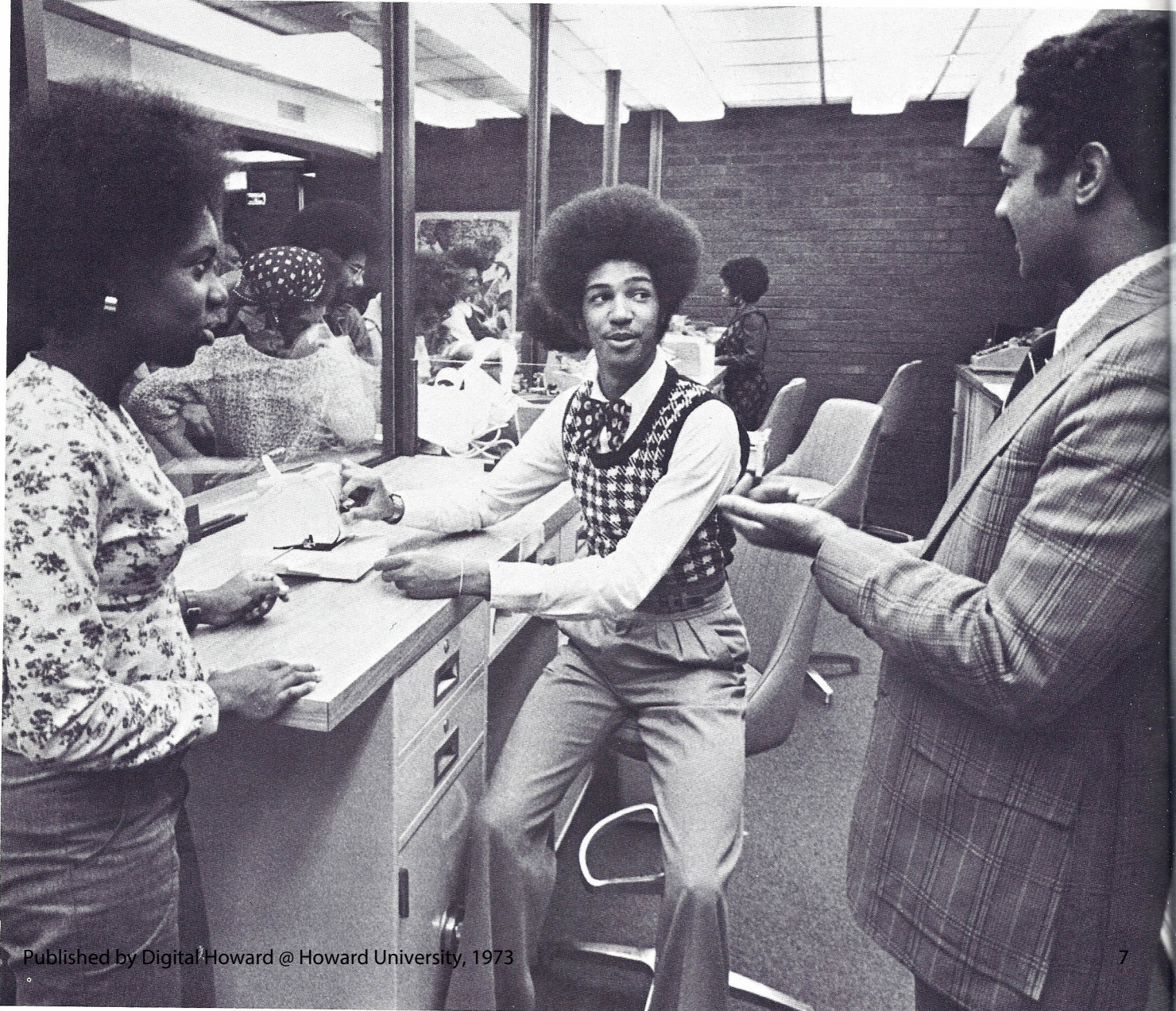
18 Ware, Greenidge and Pace discussing business.