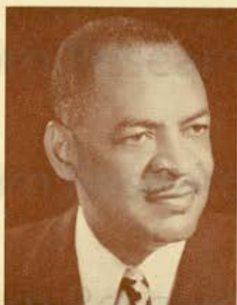
HON. WILLIAM L. DAWSON First Congressional District of Illinois