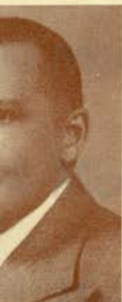
IN LANCASTER Negro Affairs Department of Commerce