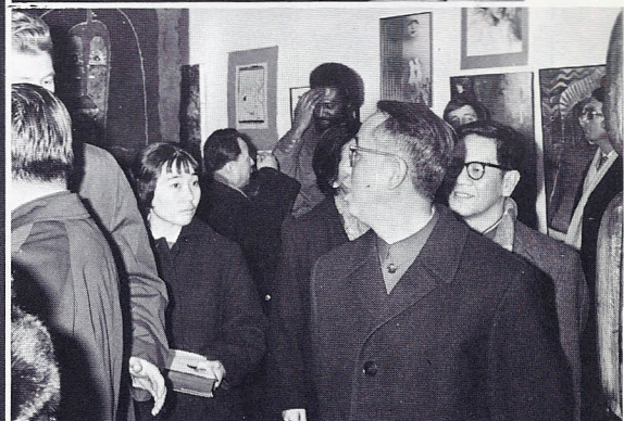
At the Gallery —The Art Gallery was one of the places which members of the Shenyang Acrobatic Troupe of the People's Republic of China visited.