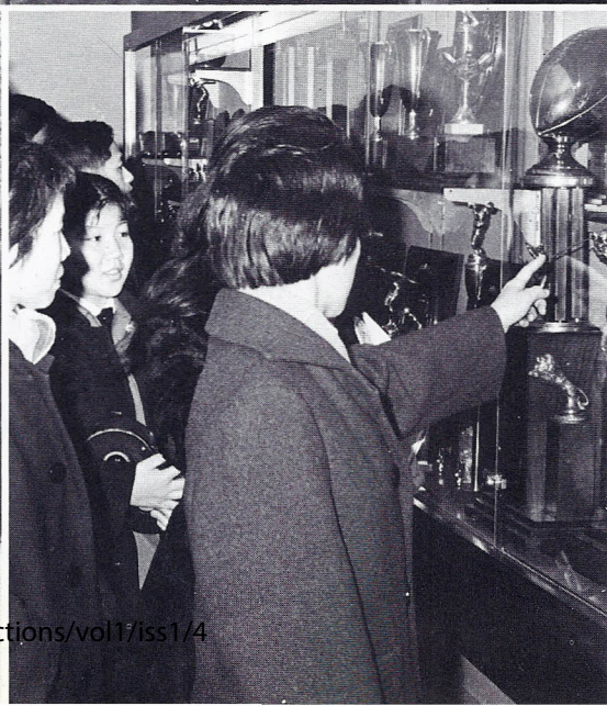
At the Athletic Department —Displays of numerous sports trophies won by teams of the University were viewed by members of the Shenyang Acrobatic Troupe.