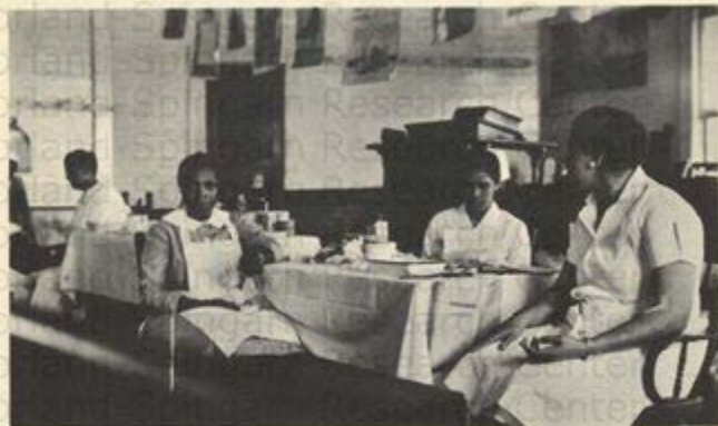
Wasserman blood testing of several thousand persons was made possible through the cooperation of the United States Public Health Service and the Solivar County Health Department. This unit was set up in the pulpit of one of the rural churches.