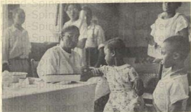
A few of the youngsters, without being coaxed, braved the formidable array of white coats and draped tables to receive that small syringe of diphtheria toxoid which might spell the difference between life and death.