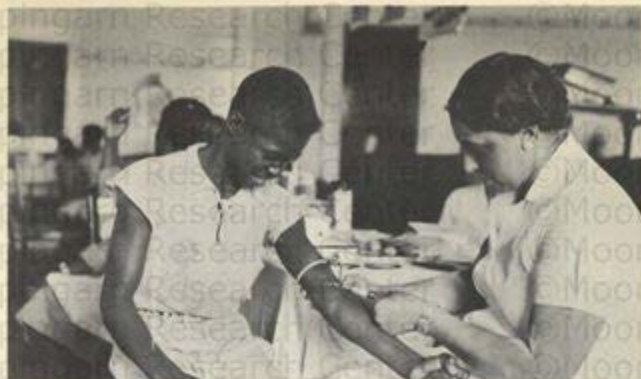
This smiling youth seems to appreciate the fact that a blood examination may give him a better chance to maintain the stalwart, splendid body he is fortunate enough to possess.