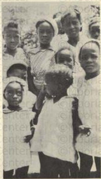
Not all of the youngsters in these groups received their injections with the serious calm of the little girl shown with the nurse, but all of them are safer now because they have received medical services from the Traveling Clinic.