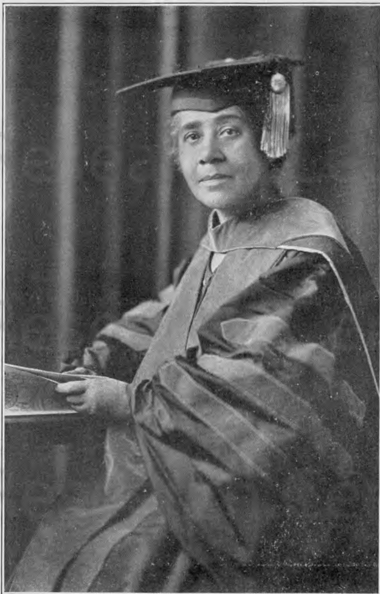
Mrs. Anna Julia Cooper, A. B., A. M., (Oberlin College) Ph. D. (University of Paris) Femina multarum literarum —A woman of extensive learning.