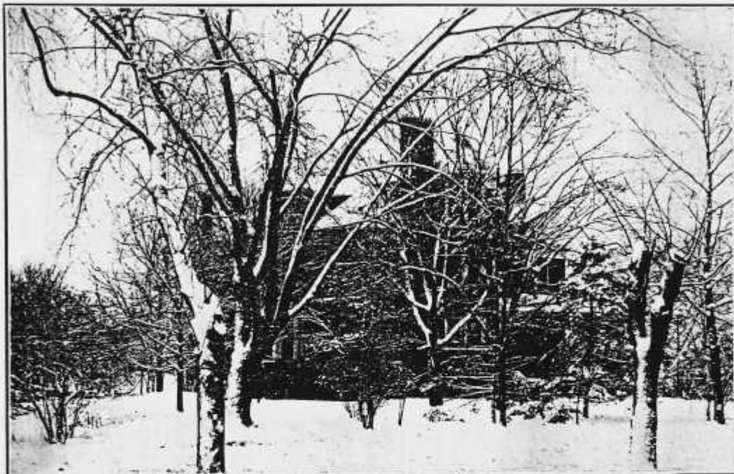
A SNOW SCENE