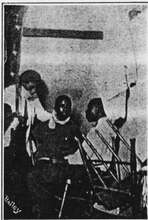
"INSECT" RICHMOND, CAPTURED BY MEMBERS OF THE CLASS '15 AT THEIR BANQUET, APRIL, 1912.