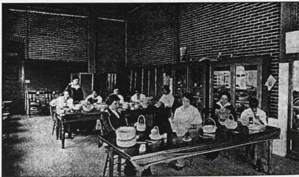
CLASS IN BASKET MAKING