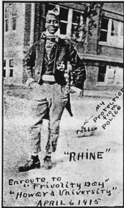
"COME AND GET ME!"