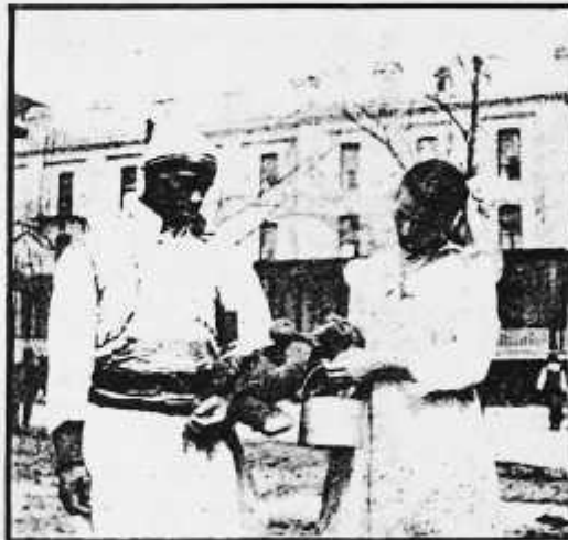
A PAIR OF KIDS