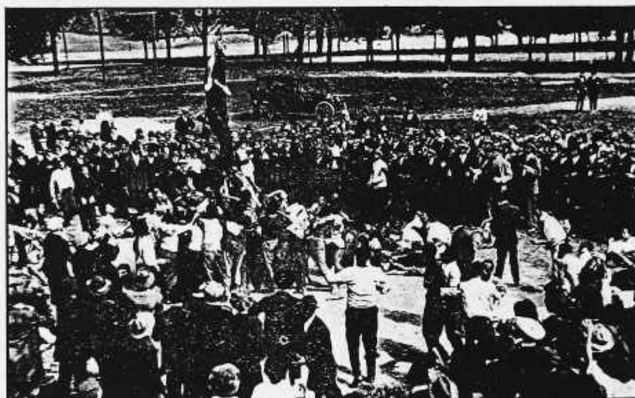
GETTING THE FLAG — FRESHMAN-SOPHOMORE FLAG RUSH