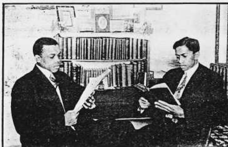
FRESHMAN "GREENHORNS" (1912).