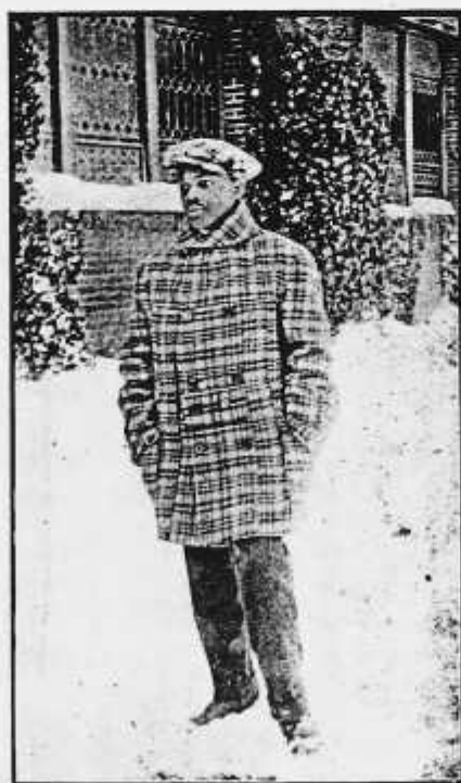
OUT IN THE SNOW