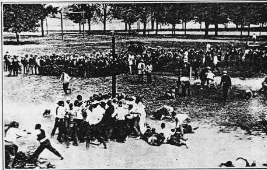
FRESHMAN-SOPHOMORE RUSH - DEFENDING THE FLAG